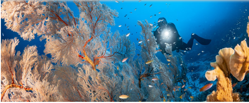
© Coral reefs abound in the waters of Tubbataha. PHOTO BY ADOBE STOCK