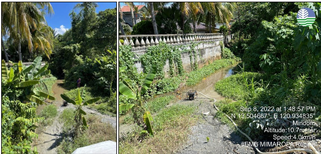
Figure 3. Traces of cement washed at the creek in Brgy. Balatero