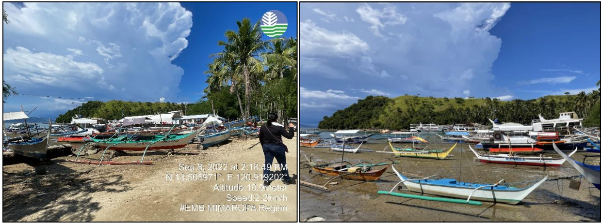
Figure 1. Location of Minolo Cove