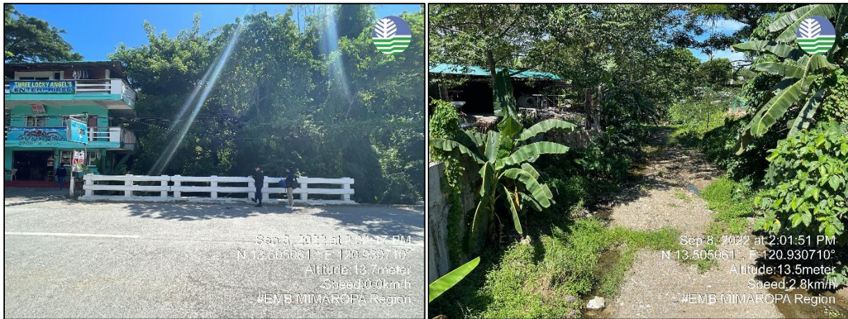
Figure 2. Location of creek in Brgy. Balatero