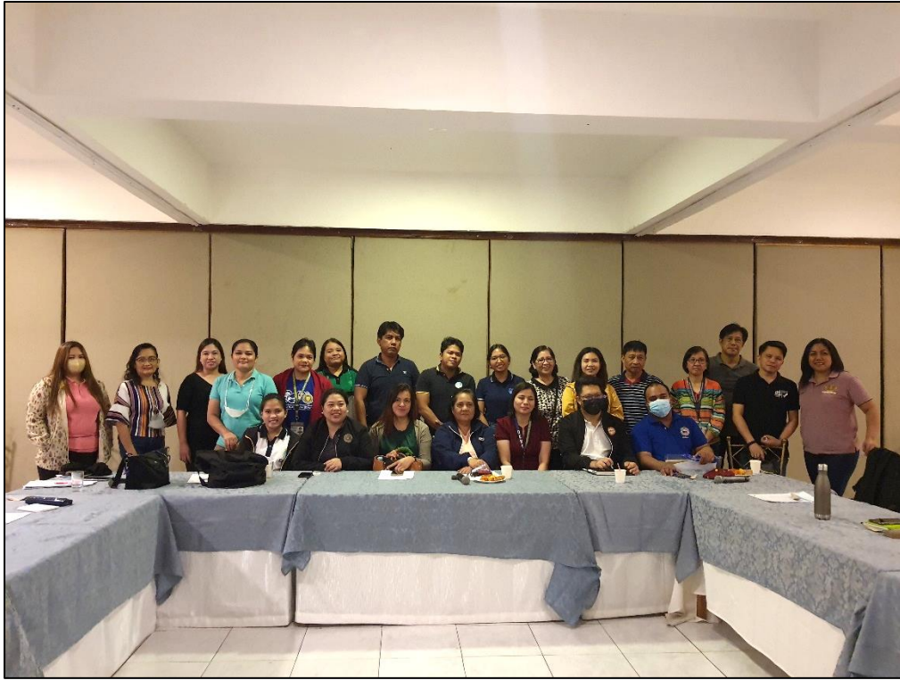
Figure 6. 4 th Quarter 2022 Sabang Bay WQMA Governing Board Meeting