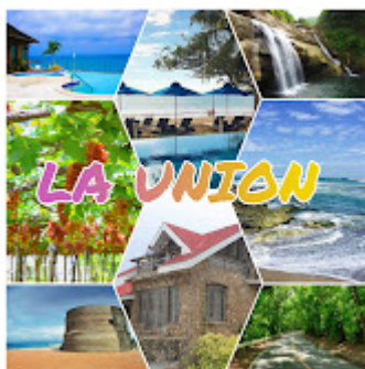
LU tourist area2.jpg 1263K