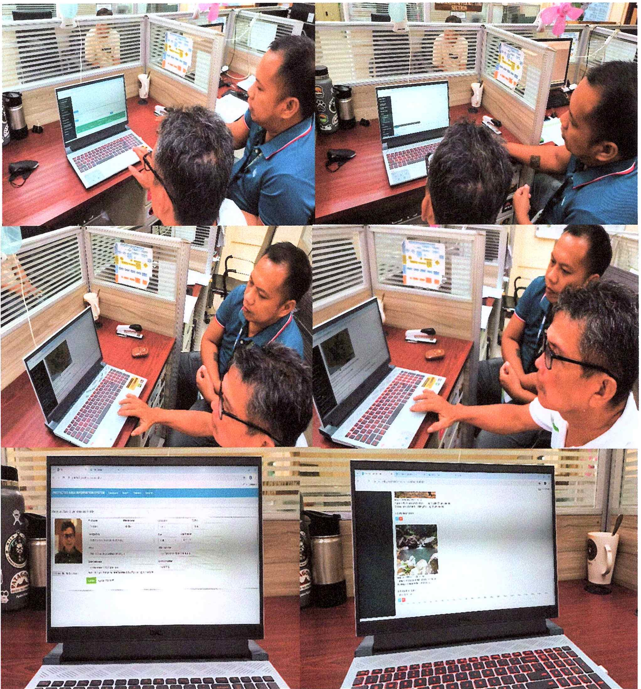
These pictures were taken during the updating of Protected Area Information System (PAIS) of Marinduque Wildlife Sanctuary (MWS).