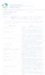
Red Memo page 1.jpg 130K