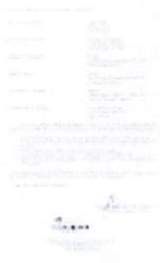
Red Memo page 2.jpg 91K