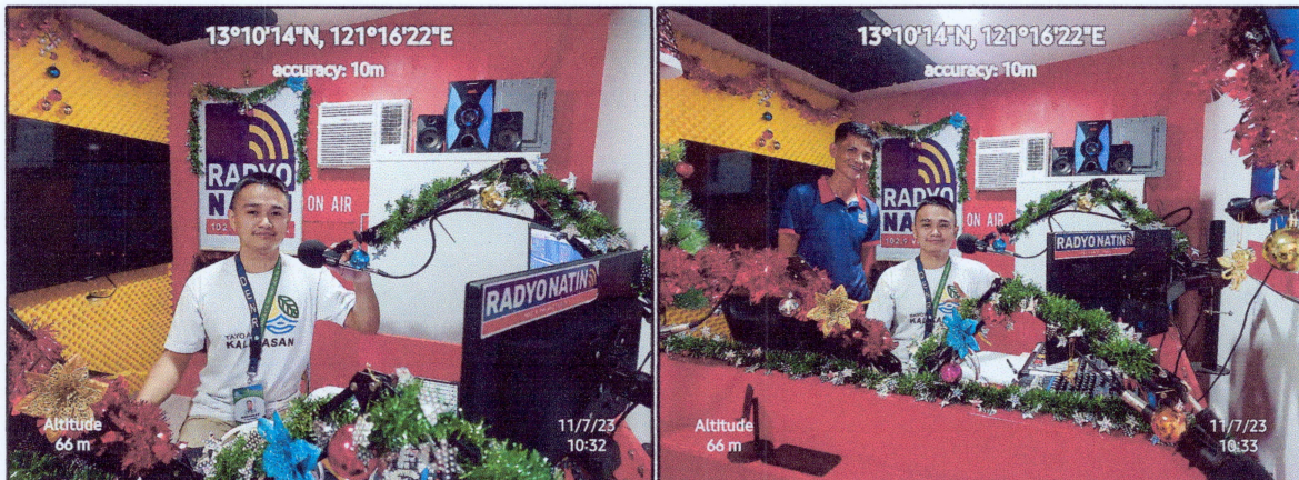
Figure 1. DENR Show through radio platform.