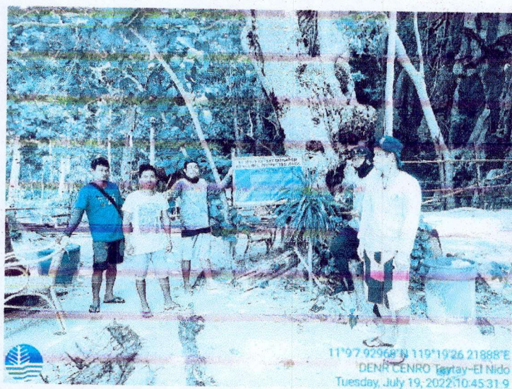
Signage installed at Big Lagoon, Barangay Bebeladan, El Nido, Palawan