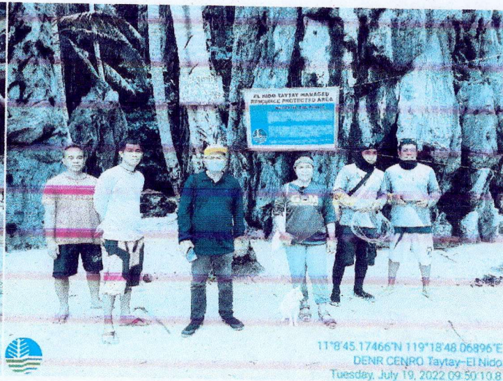
Signage installed at Secret Lagoon, Barangay Bebeladan, El Nido, Palawan