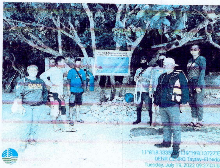
Signage installed at Shimizu Island, Barangay Bebeladan, El Nido, Palawan