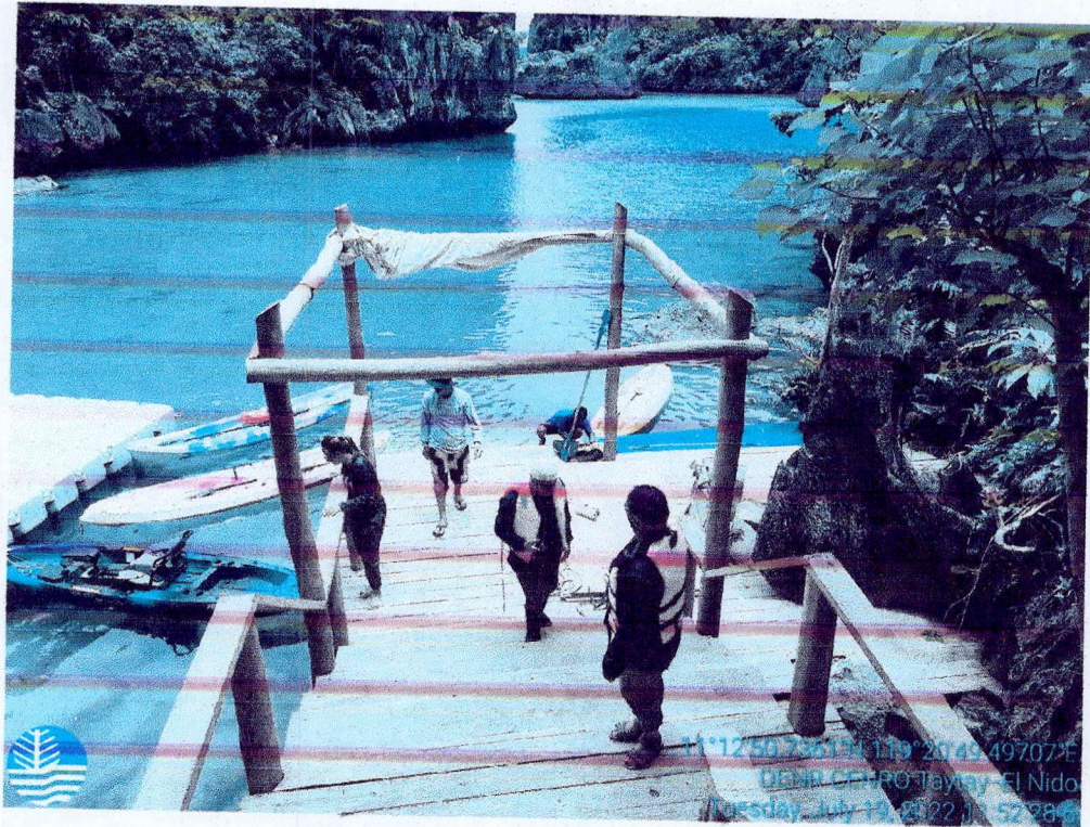
Inspection at Cadlao Lagoon, Barangay Buena Suerte, El Nido, Palawan