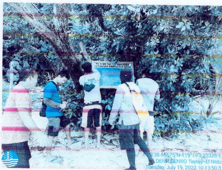
Signage installed at Bayog/Dangan Beach, Barangay Bebeladan, El Nido, Palawan