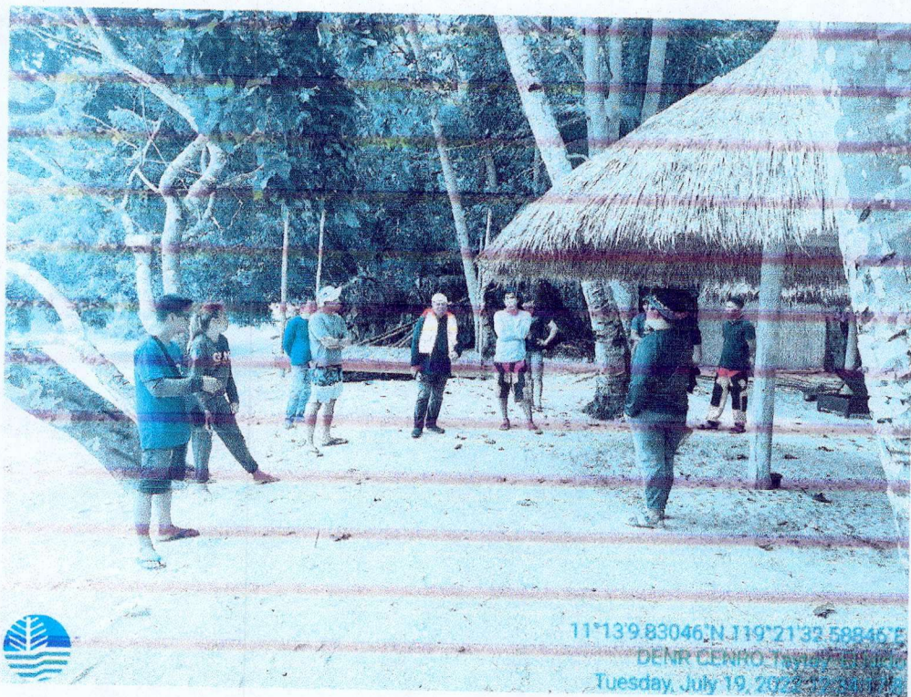
Inspection at So. Sabang, Cadlao Island, Barangay Buena Suerte, El Nido, Palawan