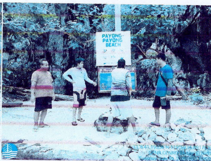
Signage installed at Payong-Payong Beach, Barangay Bebeladan, El Nido, Palawan