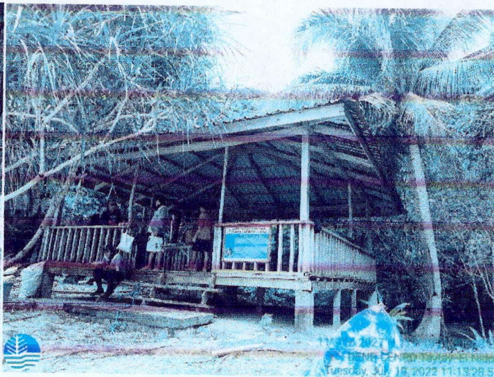
Signage installed at Small Lagoon, Barangay Bebeladan, El Nido, Palawan