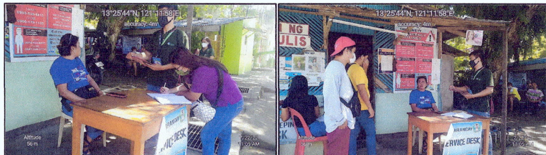
Figure 3. Coordination and interview with the officials of Barangay Lazareto and President of KAKAMBAL.