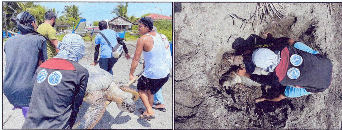
Figure 2. Disposal of dead Green sea turtle (Photo courtesy of Mr. Bautista).