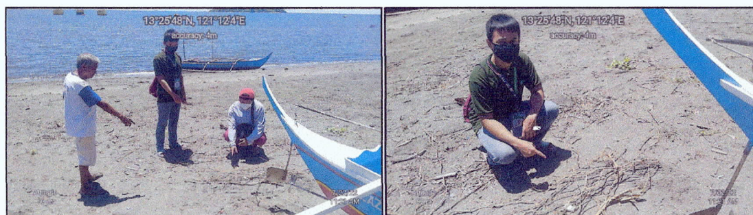
Figure 5. Burial site of dead marine turtle.