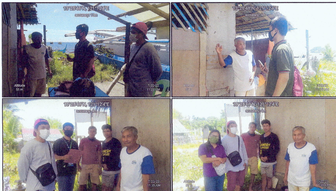
Figure 4. Coordination and interview with the Bantay Dagat .