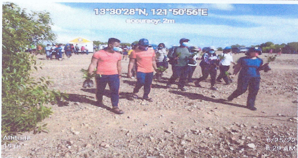
Pictures taken during the conduct of Tree Planting Activity at Brgy. Ino, Mogpog Marinduque