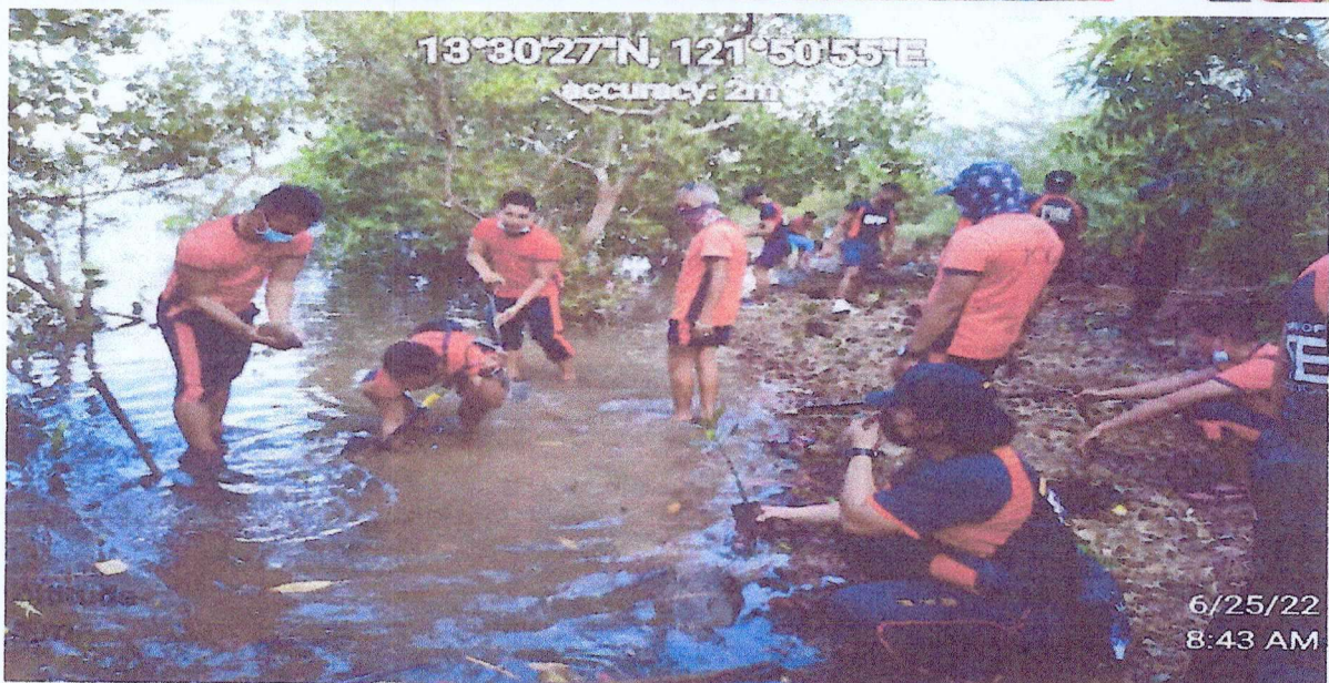
Pictures taken during the conduct of Tree Planting Activity at Brgy. Ino, Mogpog Marinduque