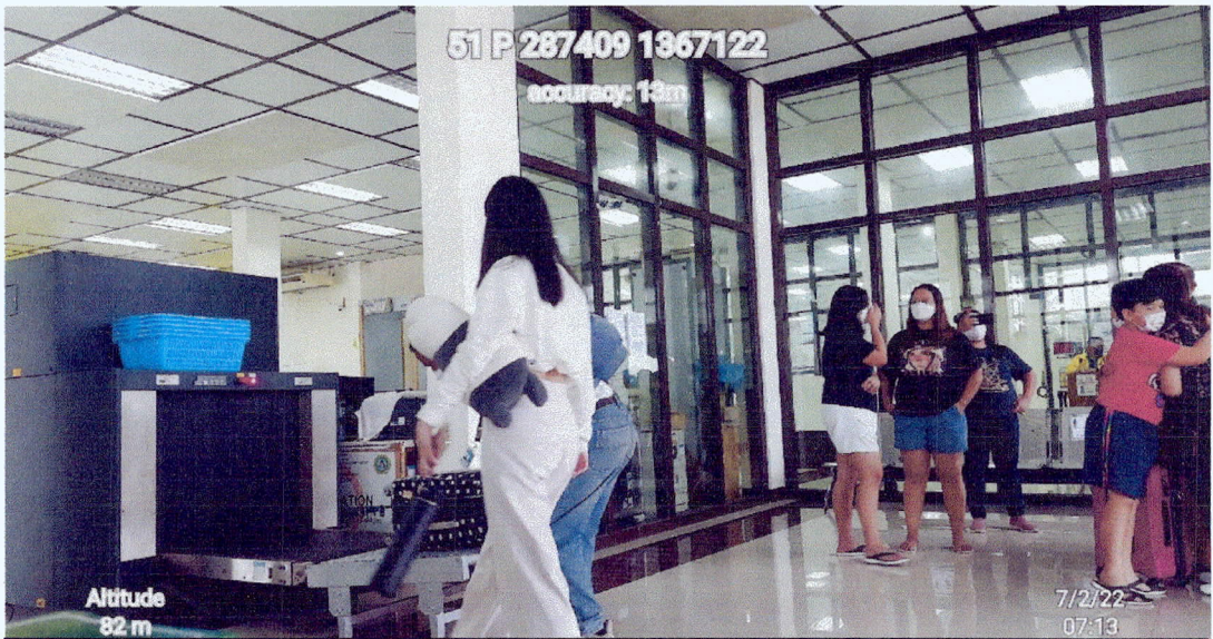
PHOTO OF PASSENGERS AT THE CHECK IN AREA OF SAN JOSE AIRPORT, SAN JOSE, OCCIDENTAL MINDORO