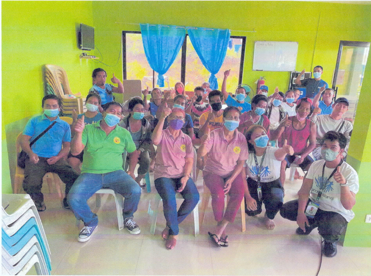
Group photo with the council and fisherfolks of Barangay Sta. Cruz, Puerto Princesa City

Telfax No. (048) 433-5638 / (048) 433-5638