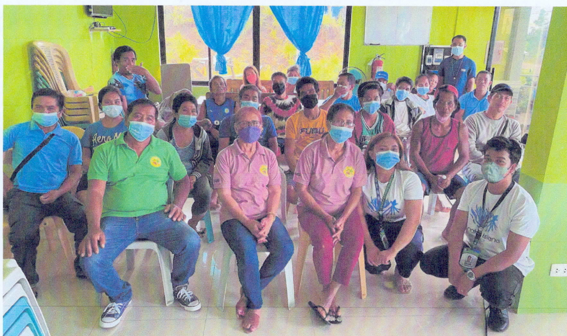
Group photo with the council and fisherfolks of Barangay Sta. Cruz, Puerto Princesa City