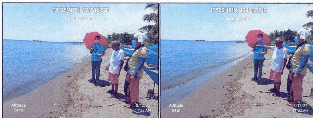
Figure 4. Location site where the Green sea turtle was released.