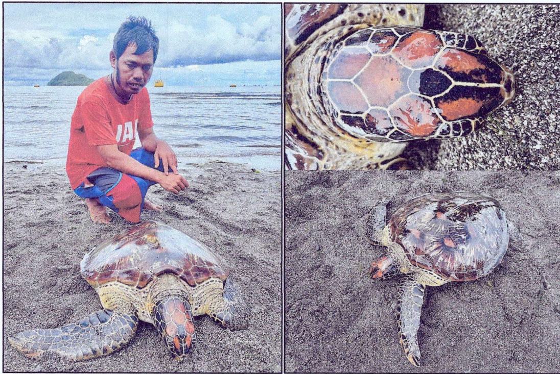
Figure 1. By-catch marine turtle in Barangay Lazareto (Photo courtesy of FMO).