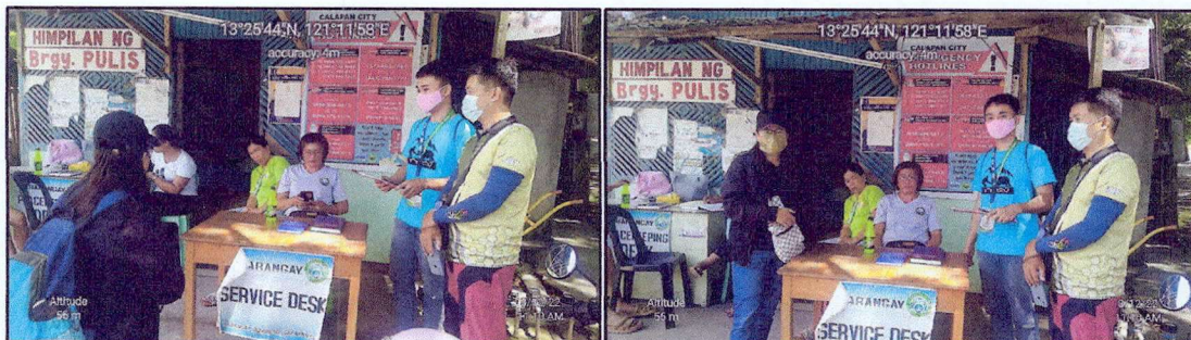
Figure 2. Courtesy call and coordination with the LGU of Barangay Lazareto.