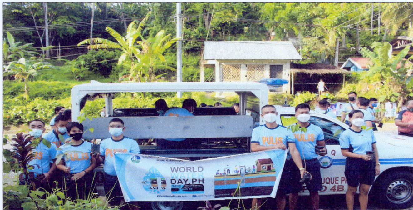
Group picture during tree planting activity with the Tarpaulin displayed on World Water Day (WWD) along the Magapua River at Brgy. Magapua, Mogpog, Marinduque on March 22, 2022.