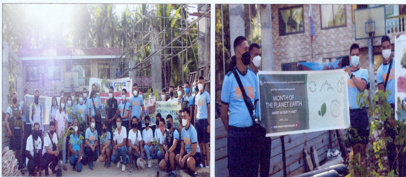
Group picture during tree planting activity with the Tarpulin displayed on Earth Day at Barangay Bocboc, Mogpog, Marinduque on April 21, 2022.