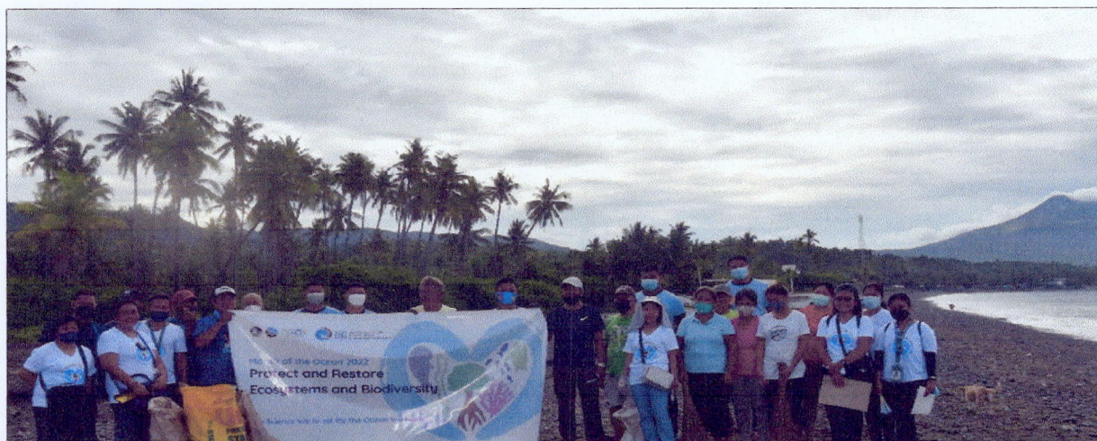
Group picture during coastal clean-up with the Tarpulin displayed on Month of the Ocean (MOO) Brgy. Antipolo, Gasan, Marinduque