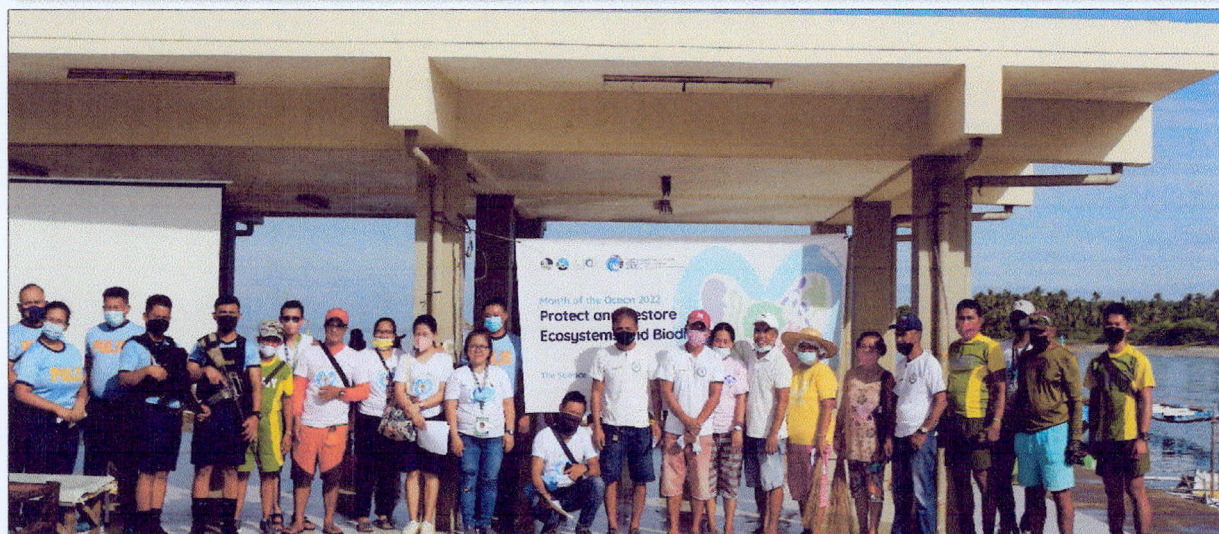
Group picture during coastal clean-up with the Tarpulin displayed on Month of the Ocean (MOO) Brgy. Daykitin, Buenavista, Marinduque