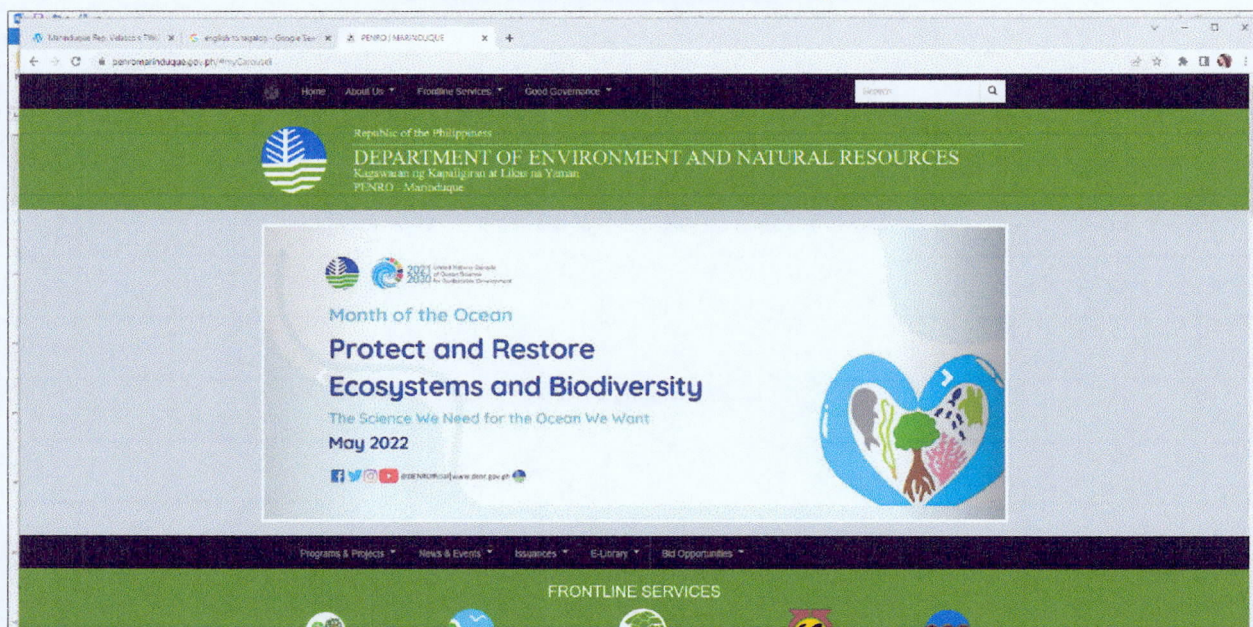
Screenshots of the Uploaded and Posted Banners and Posters at the DENR-PENRO Marinduque Official Website