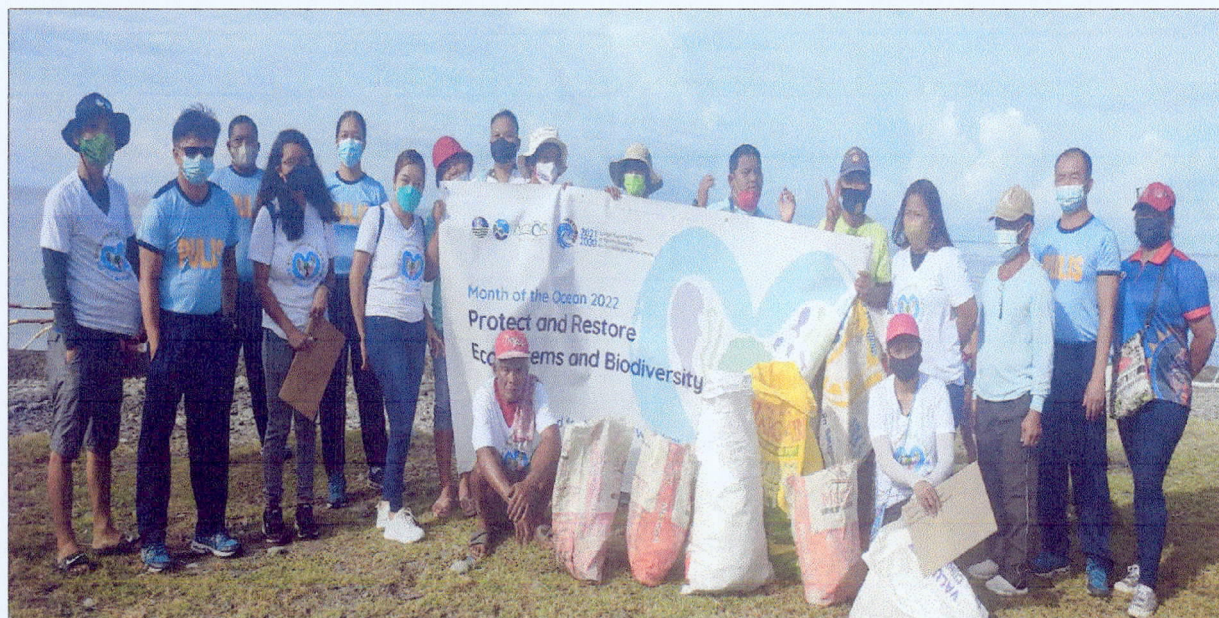
Group picture during coastal clean-up with the Tarpulin displayed on Month of the Ocean