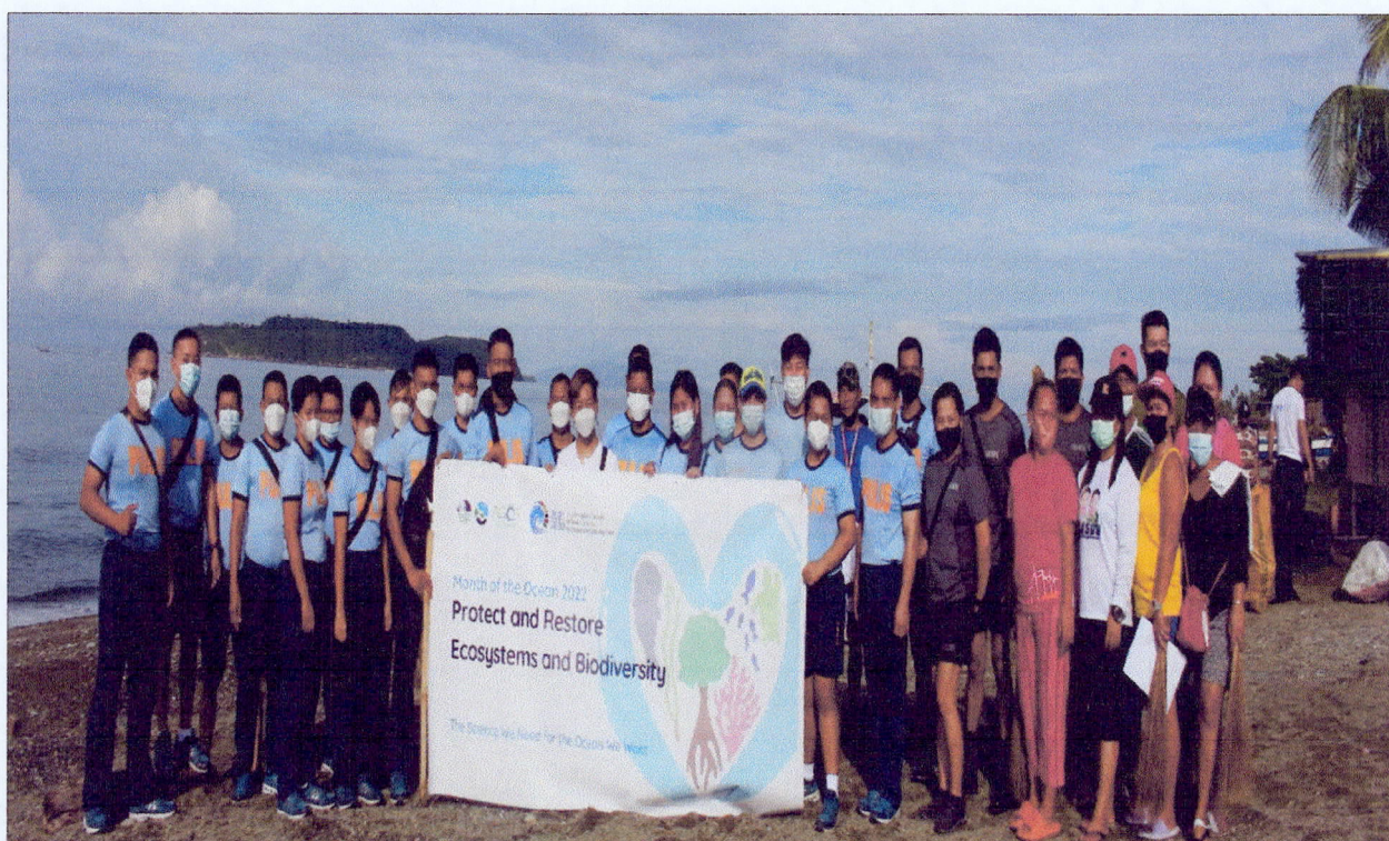
Group picture during coastal clean-up with the Tarpulin displayed on Month of the Ocean (MOO) Brgy. Banuyo, Gasan, Marinduque