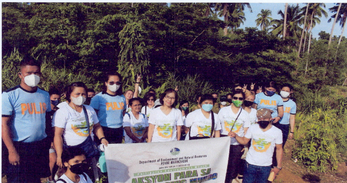
Group picture during tree planting activity with the Tarpulin displayed on Environment month at Brgy. Bocboc, Mogpog, Marinduque