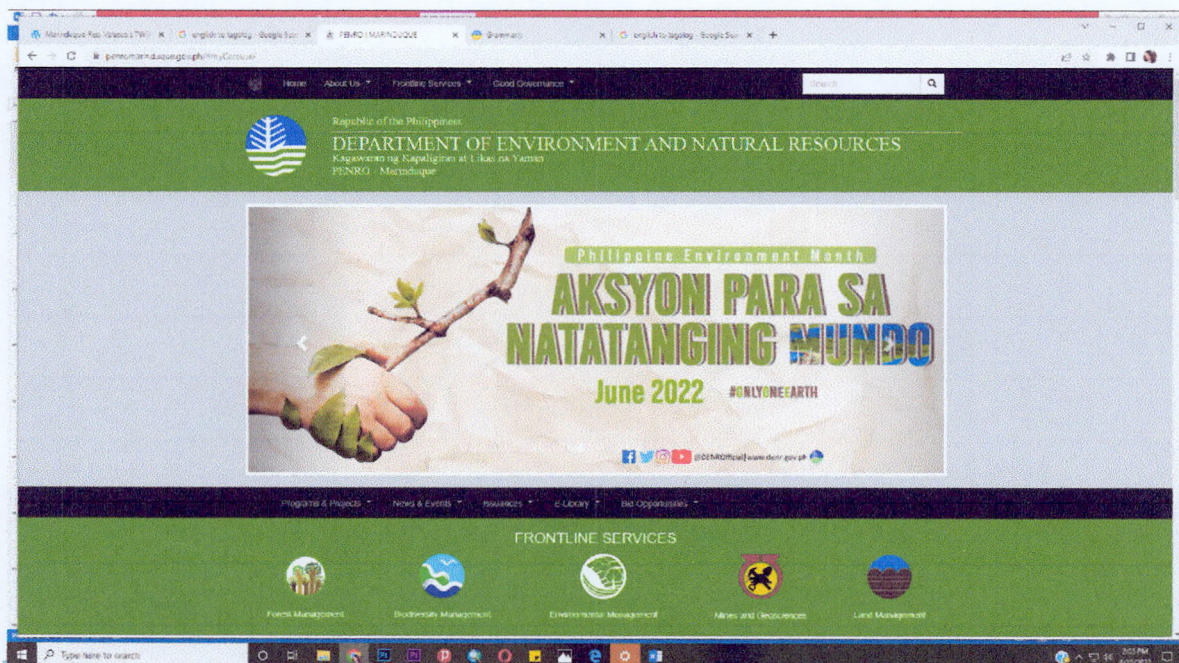
Screenshots of the Uploaded and Posted Banners and Posters at the DENR-PENRO Marinduque Official Website