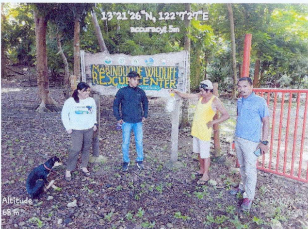
Geo-tagged photos during the releasing of one (1) cobra within Marinduque Wildlife Rescue Center