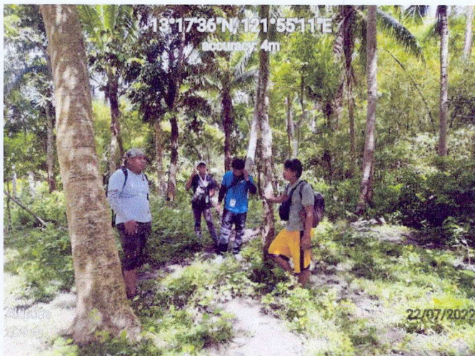
Geo-tagged photos during the coordination with barangay official of LGU Banuyo and Antipolo, Gasan Marinduque regarding the sighting of deer per posted at social media.