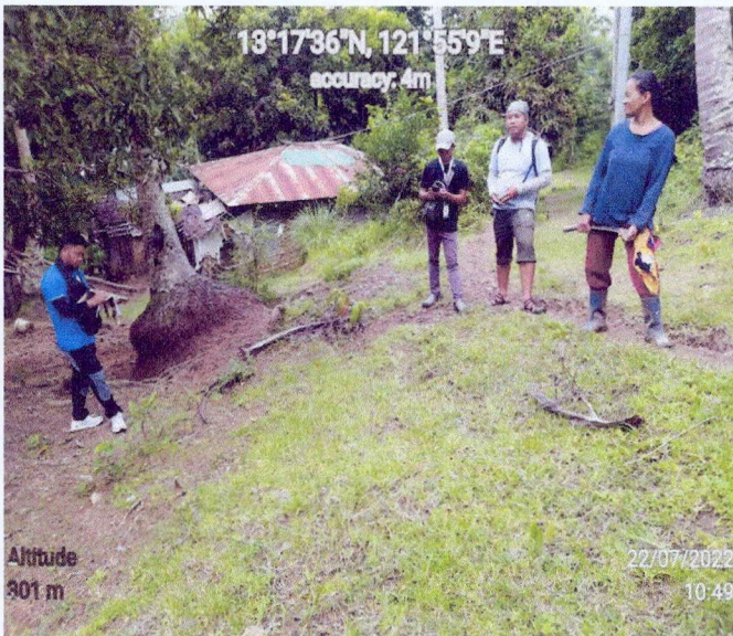
Geo-tagged photos during the coordination within the nearby residents of LGU Banuyo, Gasan Marinduque regarding the protection of sighted deer within the area.