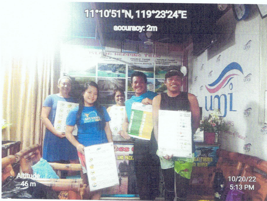
Photo during the feed backing session dated October 20, 2022.