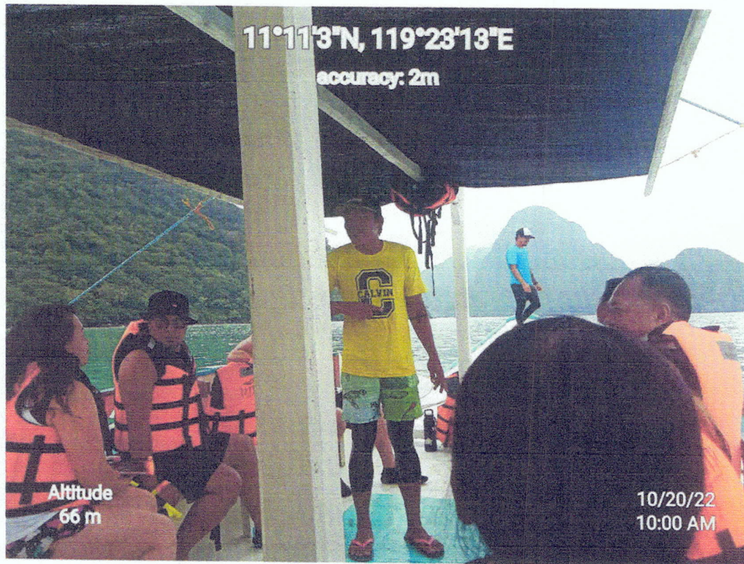
Photo during the on-board assessment dated October 20, 2022.