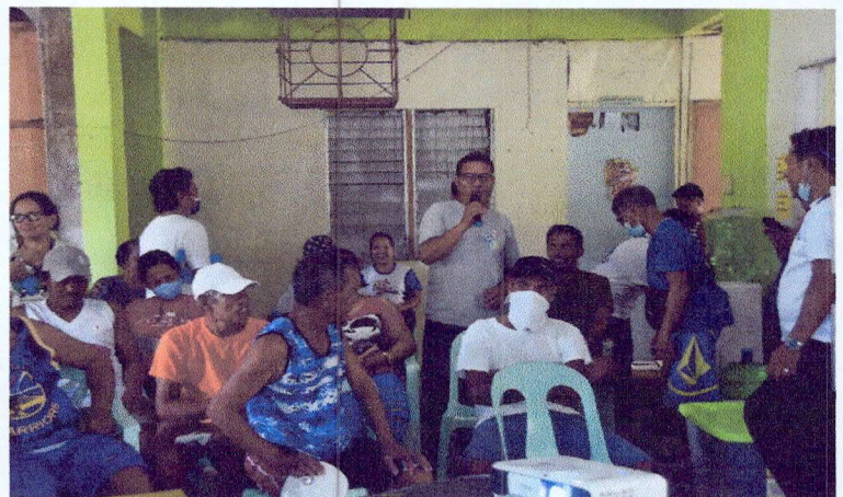
Photos of Open Forum.