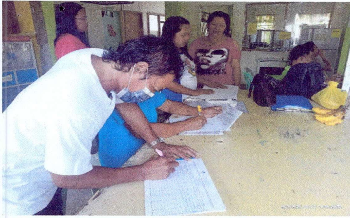
Registration of participants.