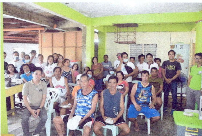
Photo opportunity of the participants in the conduct of Communication, Education and Public Awareness (CEPA).