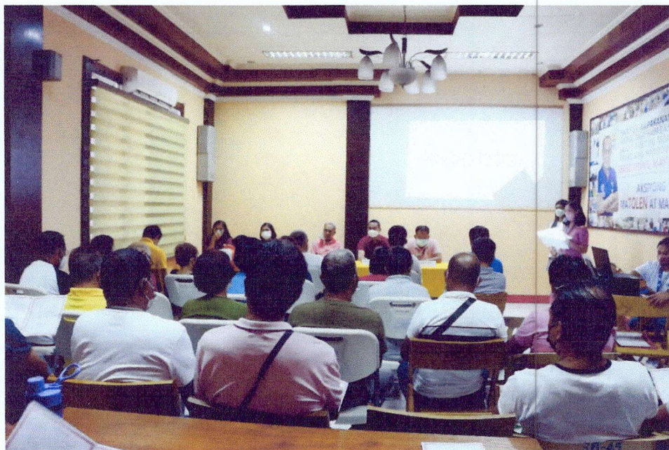
Barangay Local Government Unit Officials during the activity.