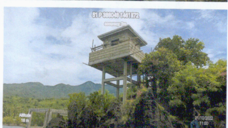
Conduct visitation their Locally-Managed Marine Protected Area (LMMPA) within their vicinity together with the BLGU Officials and DENR-PENRO, Marinduque personnel of Coastal Resources and Foreshore Management Unit (CRFMU).