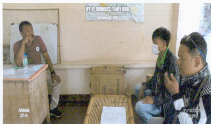
Coordination with BLGU Officials of Yook, Buenavista as part regarding the status/update of Management Plan of their Locally-Managed Marine Protected Area (LMMPAs).