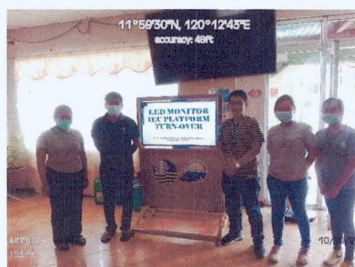
Installed a LED TV at Port,