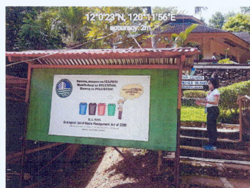
Installed signages/billboard at the Office of DENR CENRO Coron