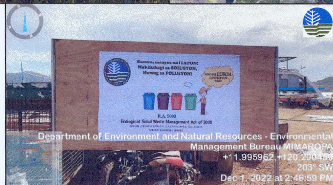
Installed signages/billboard in Brgy. 3, 6 and 5 Coron,