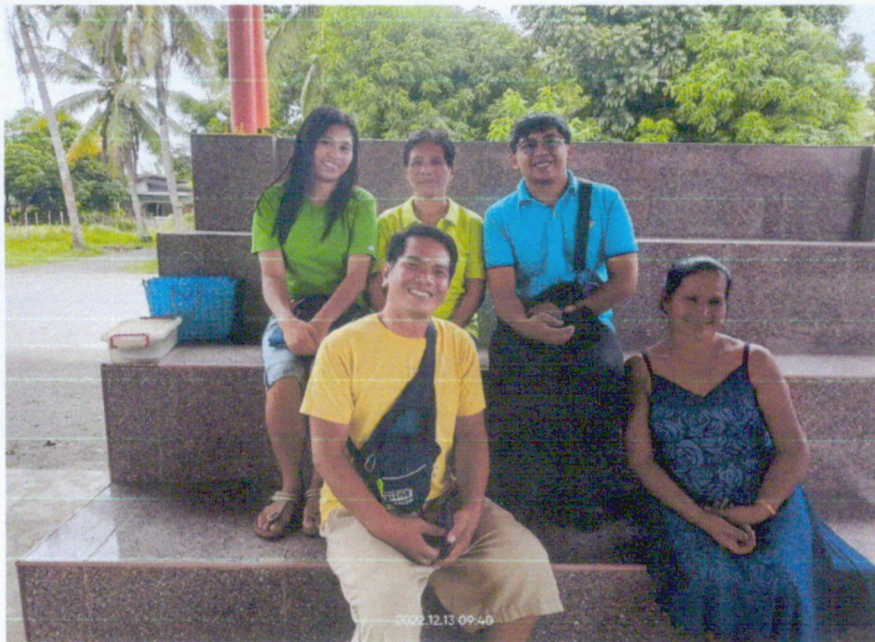
Photos showing the DENR personnel and the members of the Samahan sa Bakawanan ng Barangay Maidlang (SBBM)

Republic of the Philippines Department of Environment and Natural Resources MIMAROPA Region Community Environment and Natural Resources Office