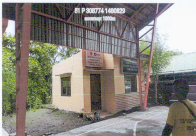
Photos showing the status of Information Center of the Samahan sa Bakawanan ng Barangay Maidlang (SBBM)