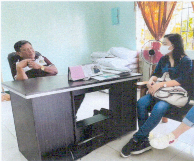
Coordination with MAO of San Teodoro regarding the proposed inclusion of the Verde Island Passage in the ENIPAS and other coastal related activities