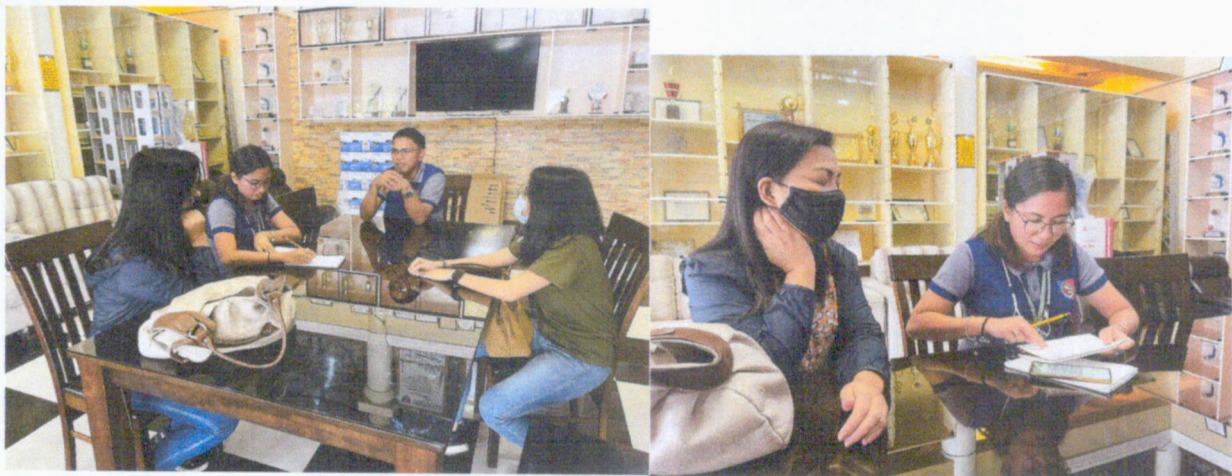
Coordination with the MENRO of Pinamalayan regarding proposed face to face meeting with the BMB and MIMAROPA Regional staff regarding Verde Island Passage PASA Orientation together with the LGUs concerned Officials