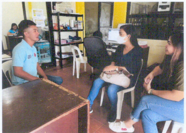
Coordination with MAO of Puerto Galera regarding the proposed inclusion of the Verde Island Passage in the ENIPAS and other coastal related activities