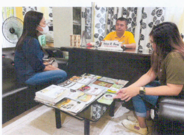
Coordination with MAO of Baco regarding the proposed inclusion of the Verde Island Passage in the ENIPAS and the request of BMB for a face to face meeting and conduct of PASA Orientation and other coastal related activities