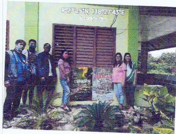
Barangay Jose Rizal, Aborlan, Palawan with Brgy. Kagawad and Brgy. Secretary