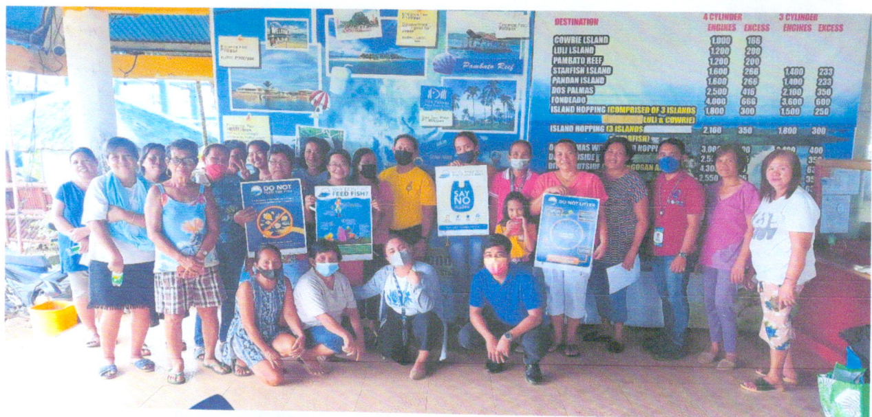
Group photo with boat owners of HOBBAI of Barangay Sta. Lourdes