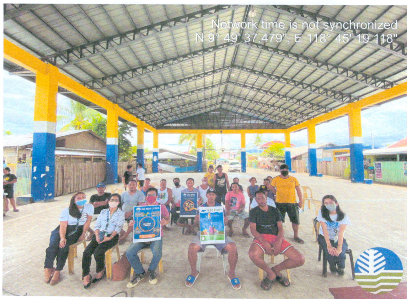
Group photo with fisherfolks of Aplaya Tagburos