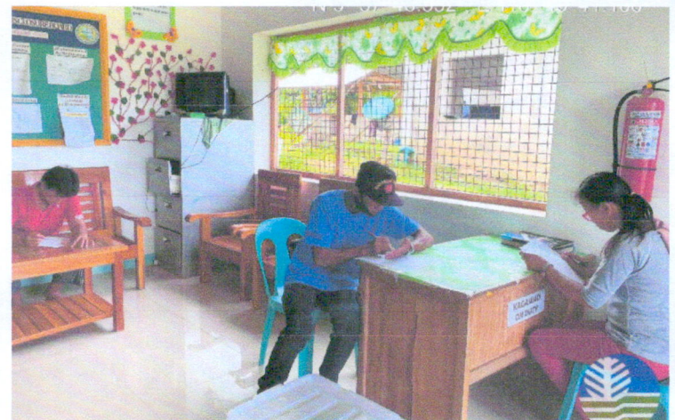
Photos during the survey on Citizen Science Monitoring and Management of Blue Carbon Ecosystems