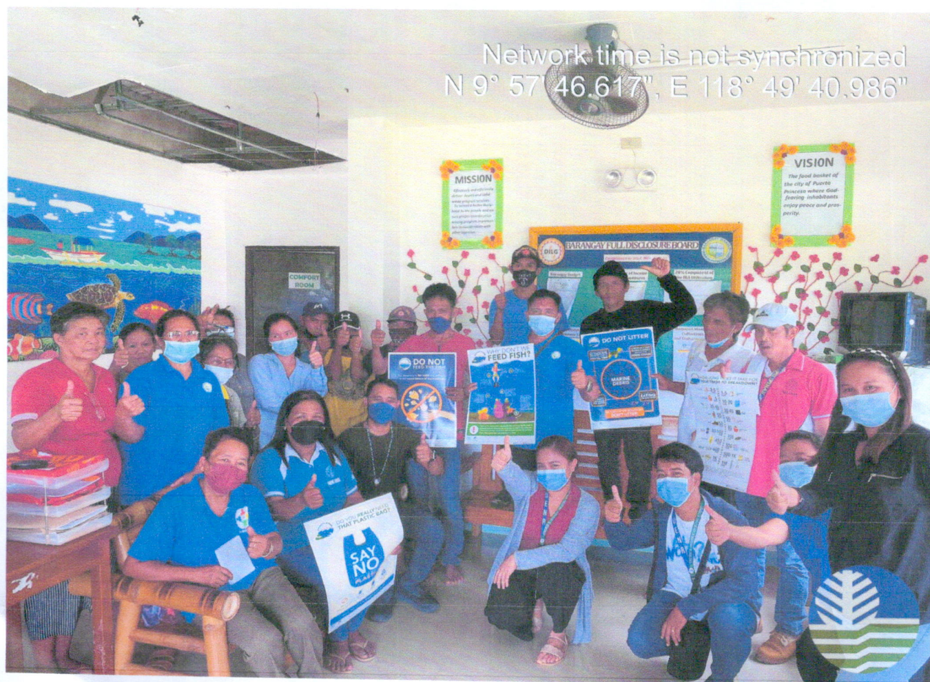
Group photo with the council of Barangay Manalo, Puerto Princesa City