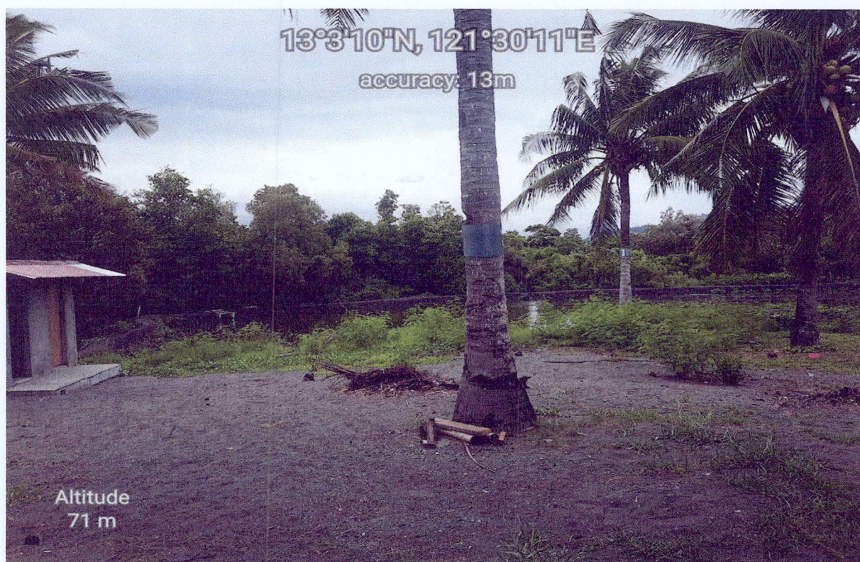
Figure 2 Photo showing the concrete bathroom erected near the fishpond.