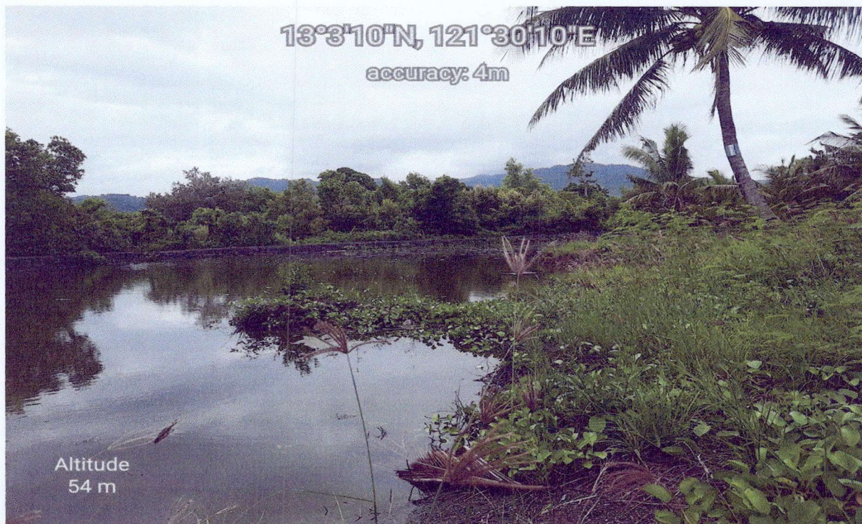
Figure 1 Geo-tagged photo showing the small fishpond adjacent to Babahurin Creek at the back of the cottages