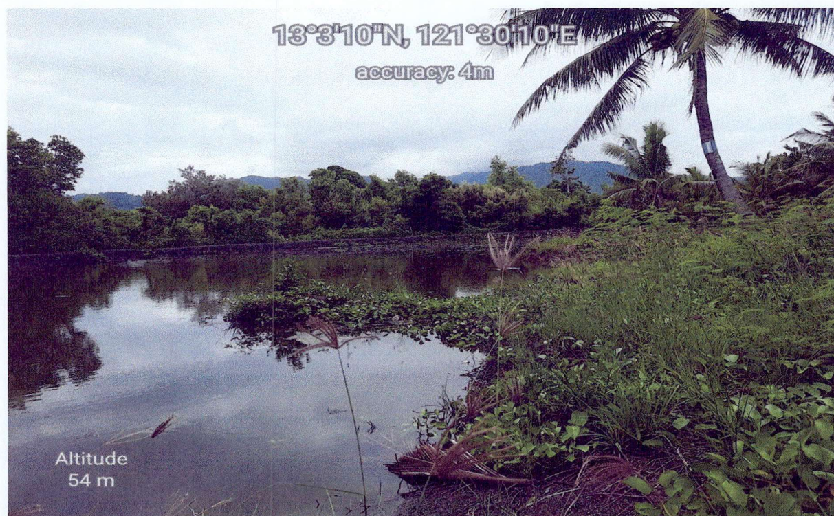
Figure 2 Photo of the entire view of the fishpond.