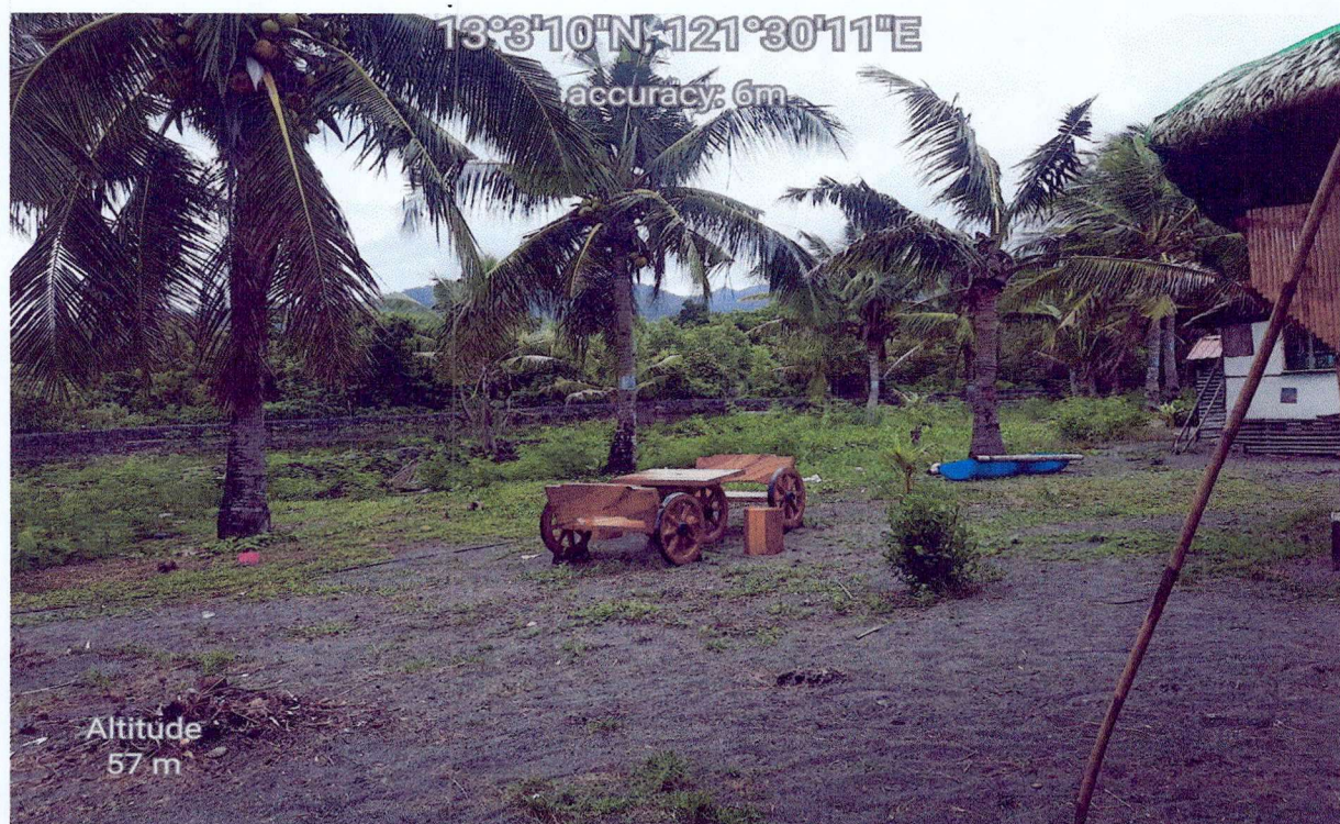
Figure 2 Photo showing one of the concrete picnic table placed at the back of the cottages, and the coconut trees planted therein.