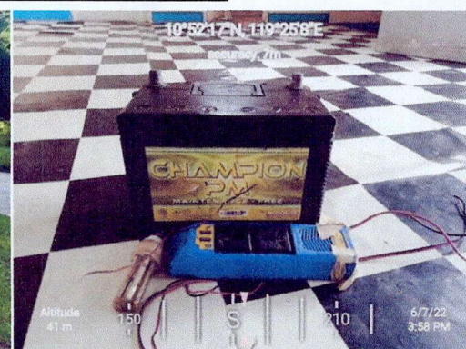
Photo showing the usual clean-up of the Office and its surroundings and not working solar battery used for lighting purposes at Visitor's Center, Barangay Pancol, Taytay, Palawan