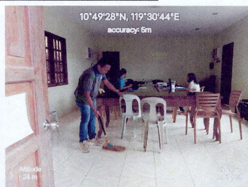
Conference Hall Bgy. Poblacion, Taytay, Palawan