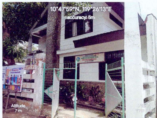
Protected Area Management Office- MSPLS Bgy. Old Guinlo, Taytay, Palawan