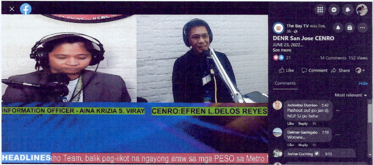
Before and during the program at 96.9 The Bay Fm station.