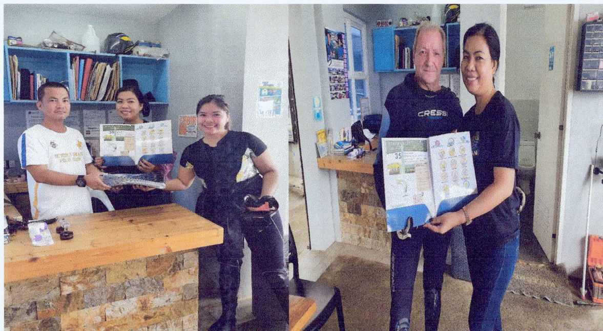
Distribution of Green Fins IEC materials to Dive shops and Divers of Sabang, Puerto Galera