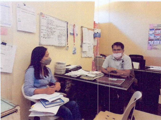
Figure 3. Photo showing Chief, CDS with the MENRO of Pinamalayan during discussion.