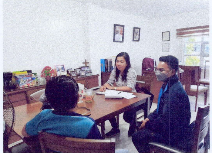
Figure 2. Photo showing PENRO personnel with MENRO of Gloria during discussion.