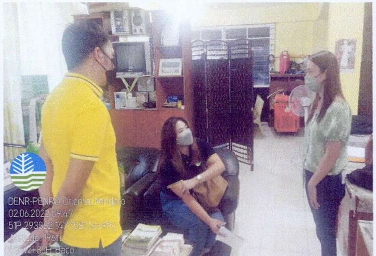
Figure 4. Photo showing PENRO personnel with the MAO staff during discussion.