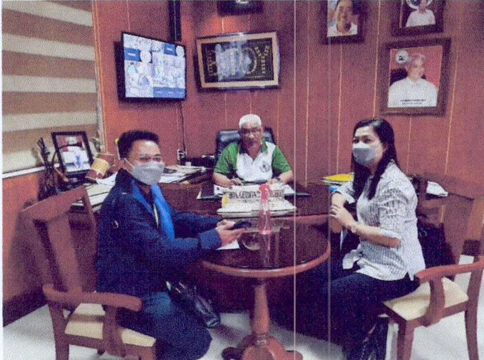
Figure 1. Photo with Mayor German Rodegerio after the discussion on ICM.

Republic of the Philippines Department of Environment and Natural Resources MIMAROPA Region Provincial Environment and Natural Resources Office