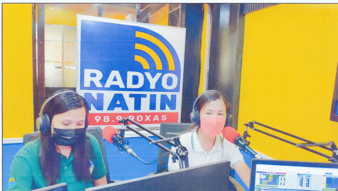
Photo taken during the airing of the program