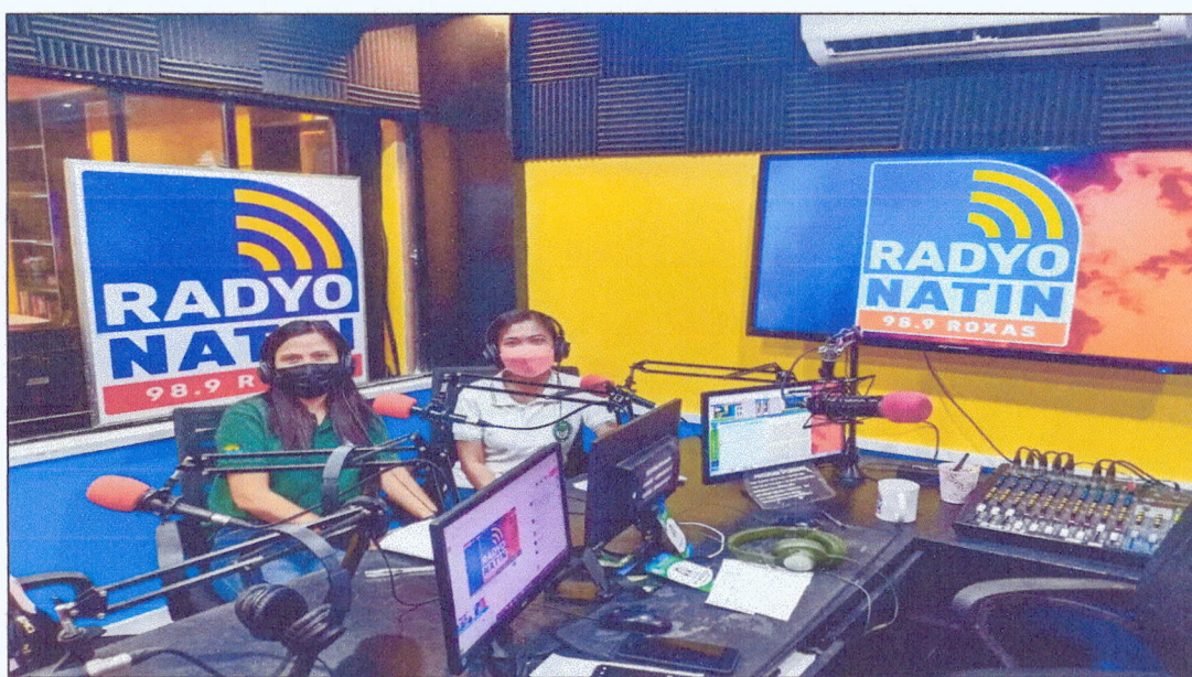
Photo taken during the airing of the program