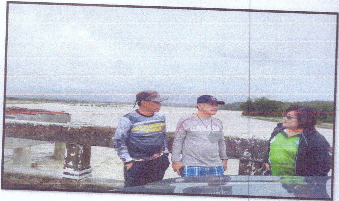
During monitoring of rivers covered by CENRO San Jose (Labangan River, Caguray River, Busuanga River, Lumintao River, Anahawin River)