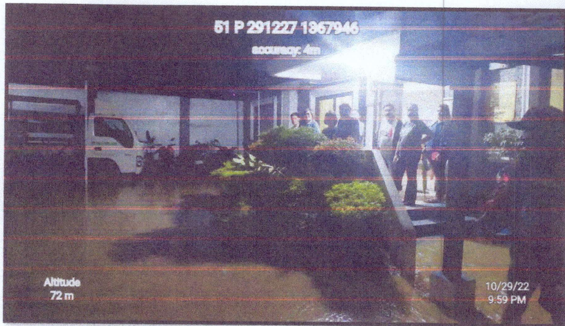
Flood at the CENRO San Jose grounds