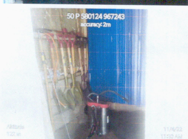
Bunk house with potting shed and storage room

M.Rodriguez St. Poblacion District I, Brooke's Point Palawan 5305 Mobile Phone: Globe: 0917-502-8916, Telephone No. (048) 726-4101 Email/Gmail: cenrobrokepoint@denr.gov.ph