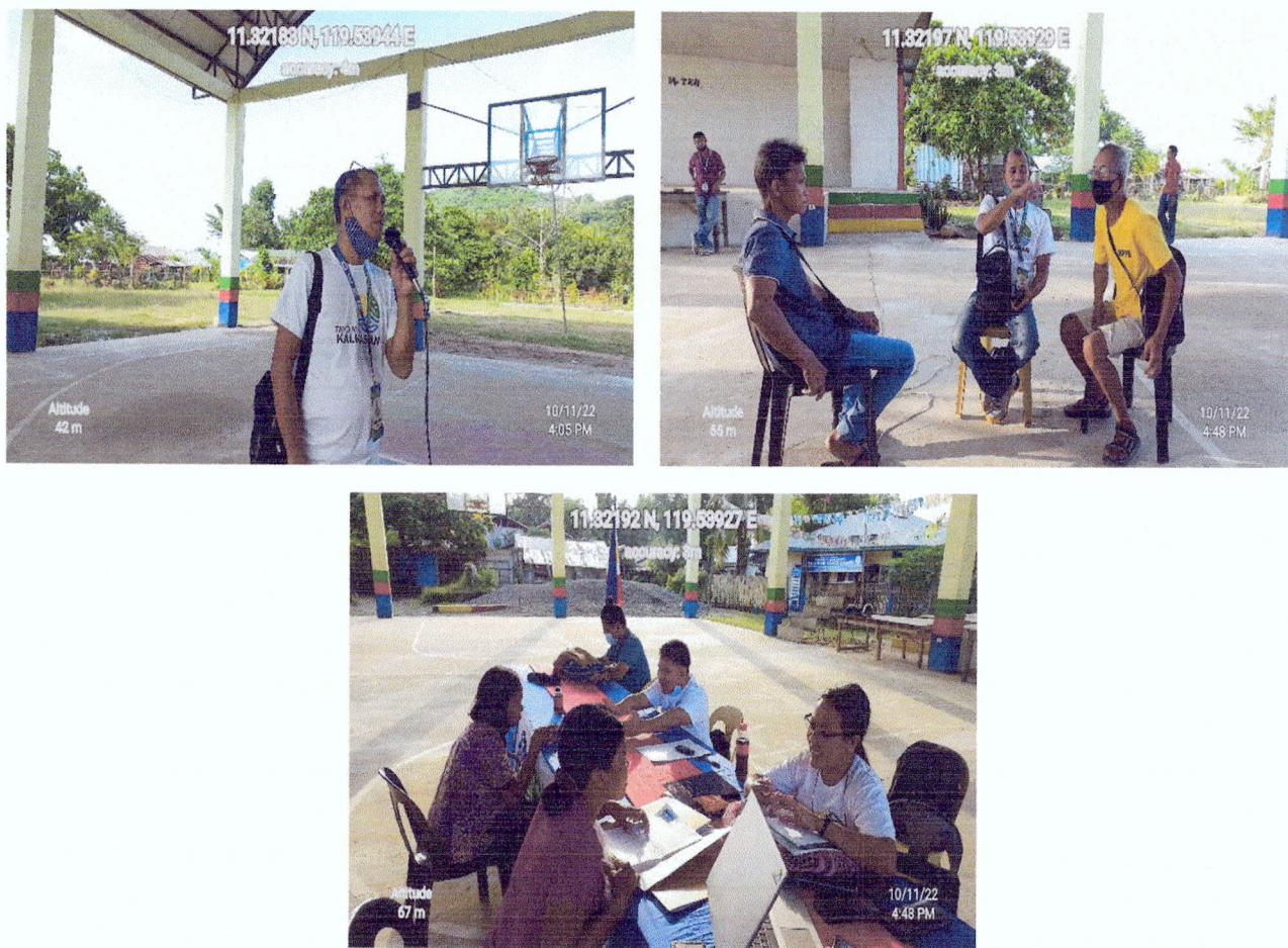
All photos were taken during the conduct of Information, Education and Communication Campaign in Barangay San Fernando, El Nido, Palawan on October 11, 2022.

These issues and concerns have been recorded for consultation with referral to concerned unit.