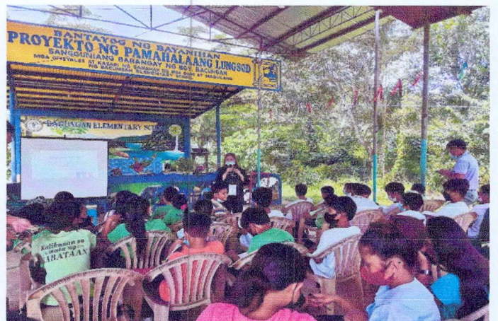
Pictures taken during the Environmental Education Lectures on October 13-14, 2022 at Maranat Elementary School and Bacungan Elementary School