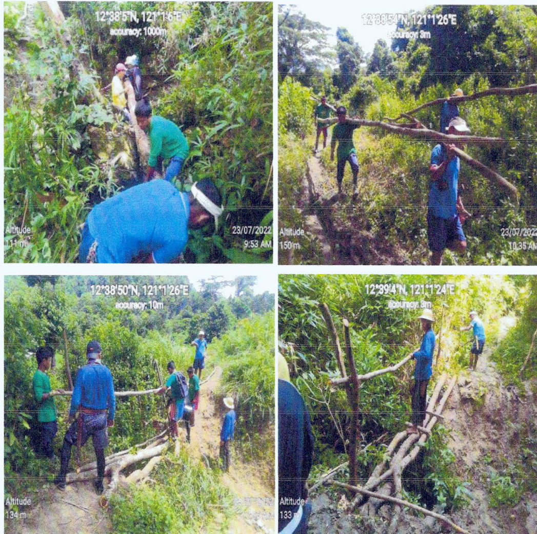
Figure 3. MIBNP-PAMO field personnel repaired the footbridge along the way from Station 1 to Station 2

the likelihood that multiple routes would develop as well as to protect the landscape and the trail users.