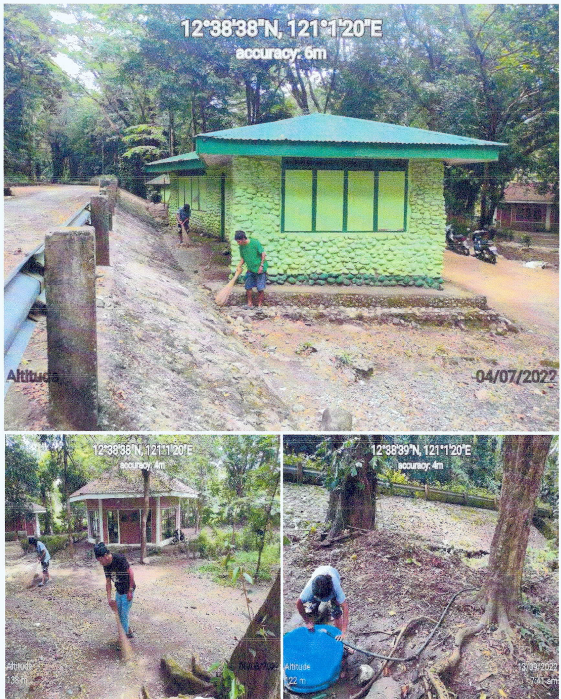
Figure 1. Regular cleaning and brushing of ranger stations and surrounding facilities inside MIBNP