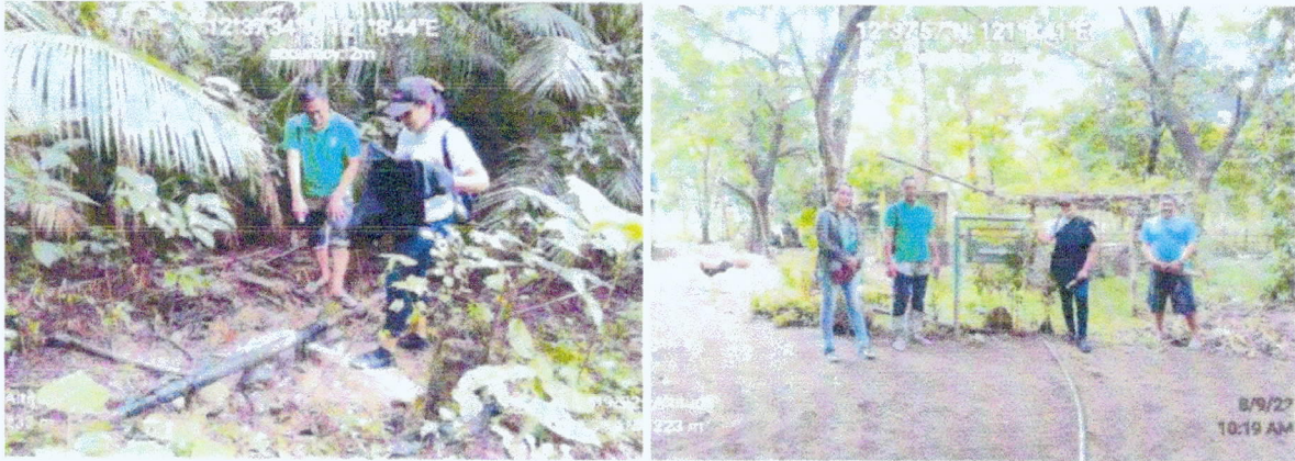
Figure 5. Geotagged Photos during the conduct of Pre-inspection of facilities for repair on August 9-12, 2022