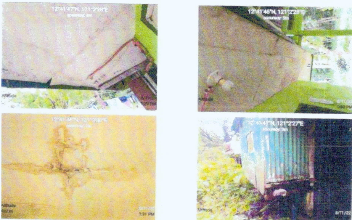
Figure 4. Photos of facilities found within MIBNP that needs to repair