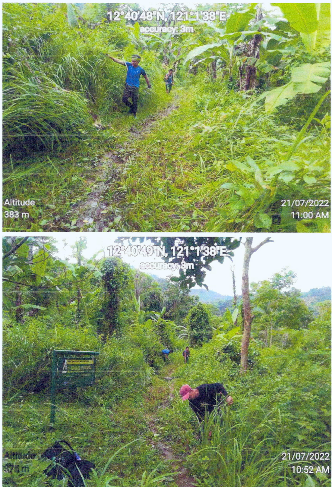
Figure 2. Park Attendants during the conduct of brushing and maintenance of trails from Bayanan Creek to Station 1