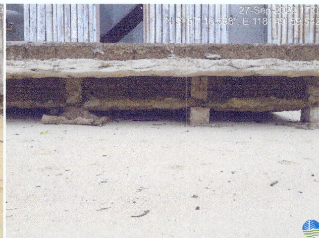
Photos of the comfort room in the Northern Part of the island where the sand is shifting