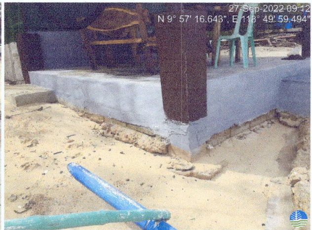
Photos of the kitchen area where the sand is shifting