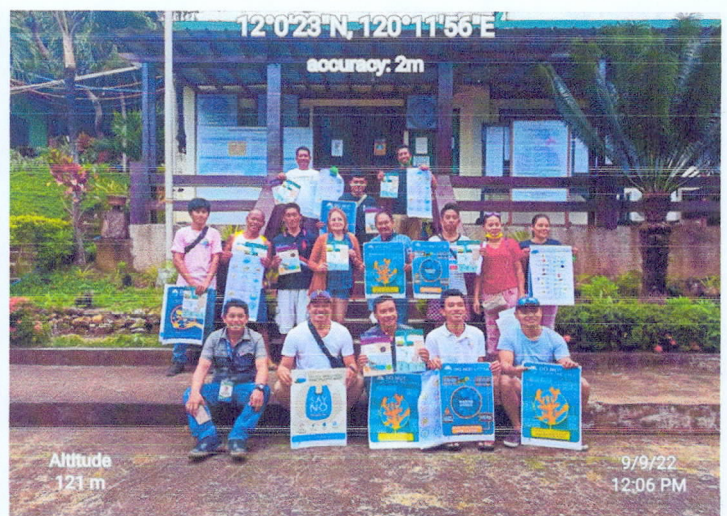
IEC Materials distributed to dive shop operators and diver of Coron, Palawan