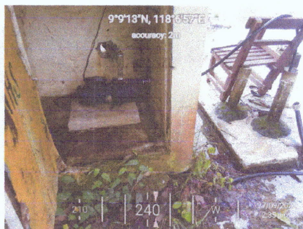
Electric-motor water-pump used by Doris Martinez National High School in withdrawing natural ground-water (deep well)