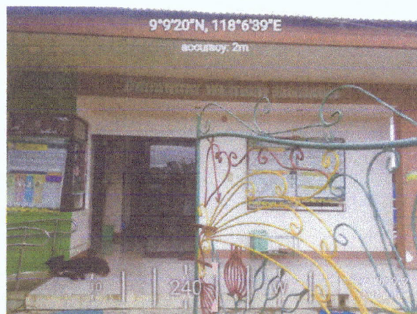
LGU Abo-abo : Brgy. Hall and Health Center : with an Ave. usage of 800 & 400 liters, respectively.