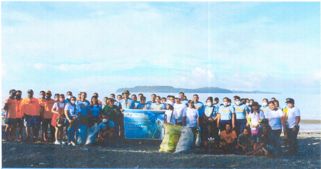
Group picture together with the DENR Personnel, Philippine National Police (PNP), Philippine Coast Guard, group of associations and Barangay Stakeholders.