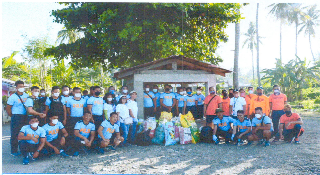
Group picture together with the DENR Personnel, Philippine National Police (PNP), Philippine Coast Guard, group of associations and Barangay Stakeholders.