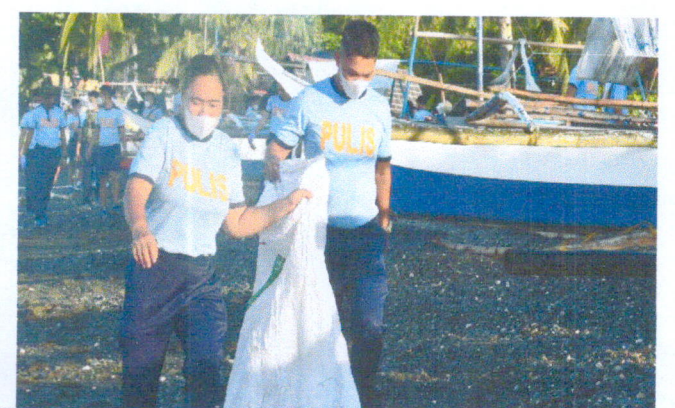
During the coastal Clean-up activity participated by DENR Personnel, Philippine National Police (PNP), Philippine Coast Guard, group of associations, and Barangay Stakeholders.