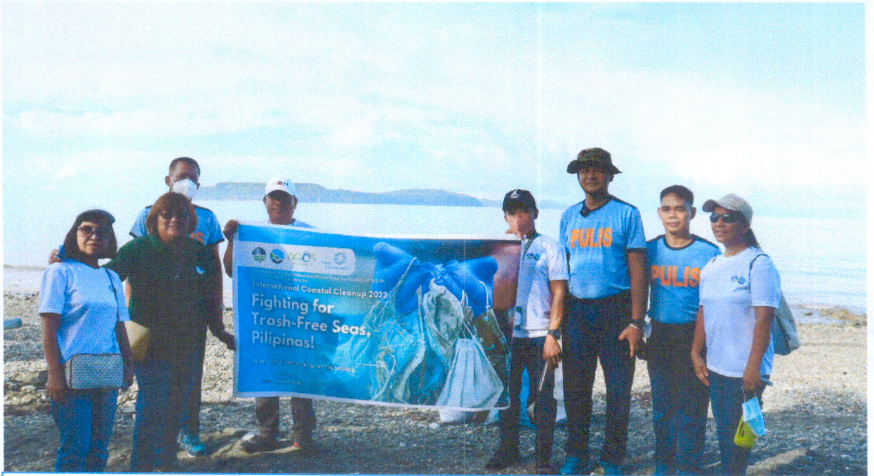
Group picture together with the DENR Personnel and PNP