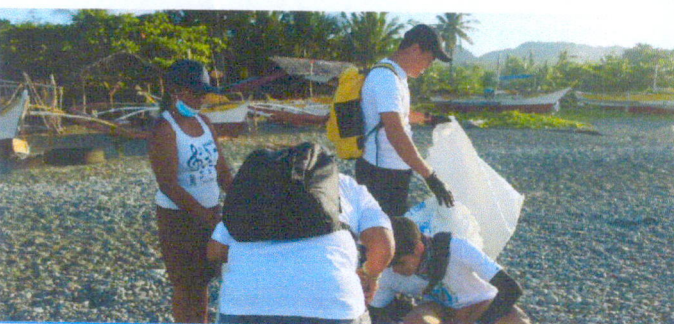
During the coastal clean-up activity participated by DENR Personnel, group of associations, and Barangay Stakeholders.