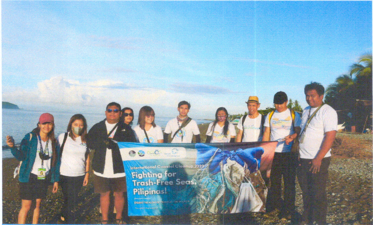
Group picture together with the DENR Personnel in Brgy. Banuyo, Gasan, Marinduque