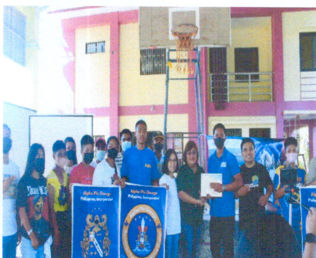
Awarding of Certificate of Appreciation to Ecological Justice League of Youth Leaders MIMAROPA