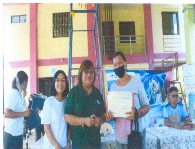
Awarding of Certificate of Appreciation to Barangay Antipolo