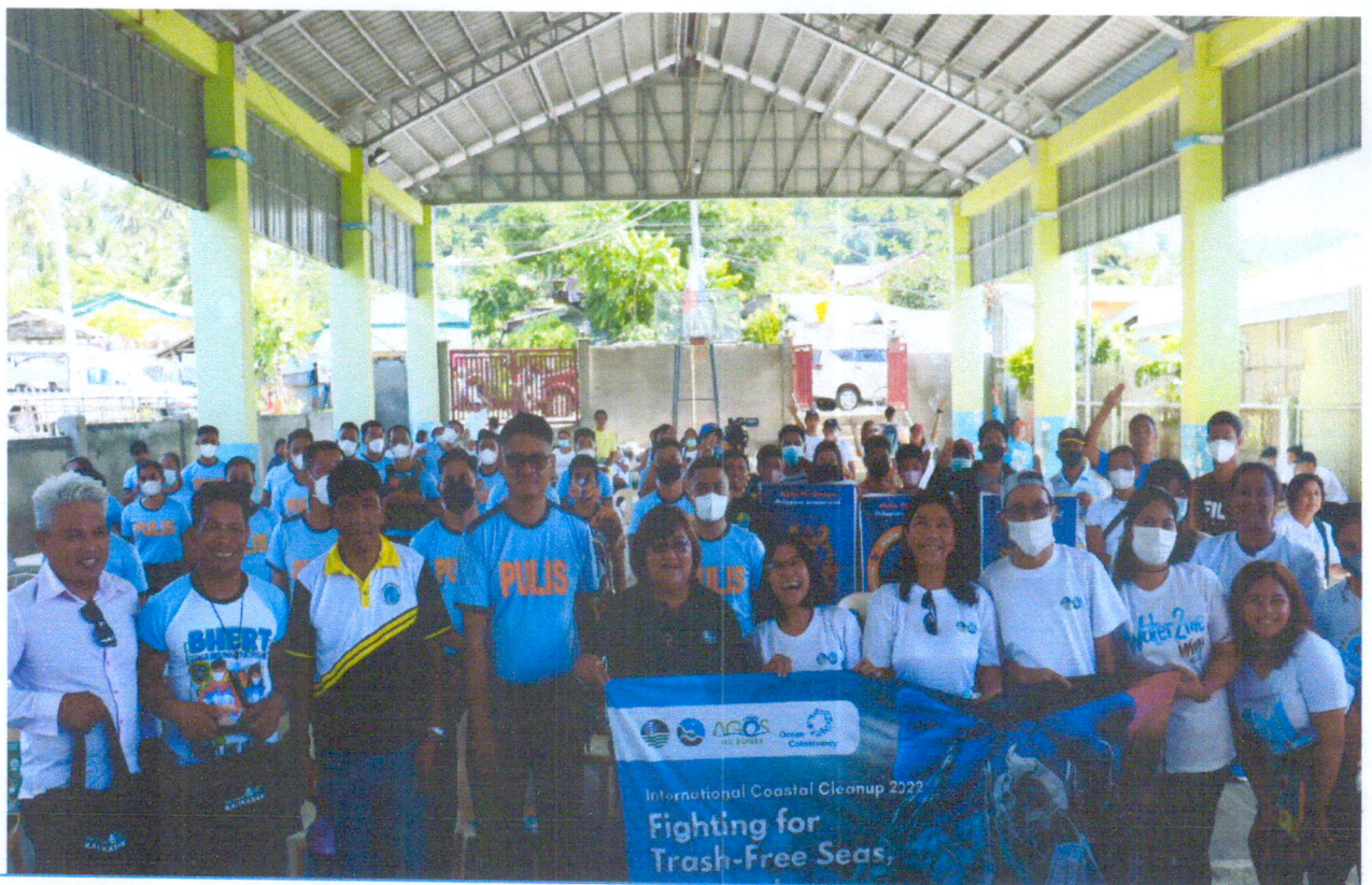
Group picture together with the DENR Personnel, Philippine, PNP, Philippine Coast Guard, group of associations and Barangay Stakeholders.