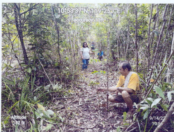
Geo-tagged photos above are taken during the conduct of monitoring, evaluation and inspection on the accomplishments of the NGP family partners/contractors.