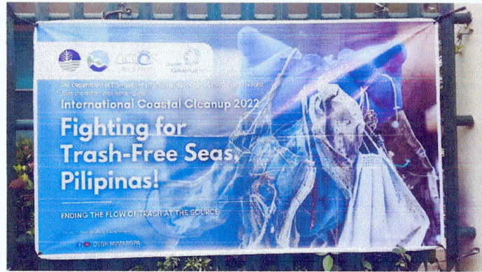
Cloth Banner hung in front of CENRO Brooke's Point Office

Corporation, Grace Guardians, Alpha Kappa Rho, Sigma Beta, Kappa Rho Kappa, Alpha Phi Omega, Palawan Charity Riders Club, Hans Vience Lance Company, Western Philippines University, DepEd and CENRO Brooke's Point personnel. A total of 191 sacks or 1,705 kilograms of trash were collected. The wastes collected by the participants were transferred to the Municipal Sanitary Landfill by the LGU SWM.