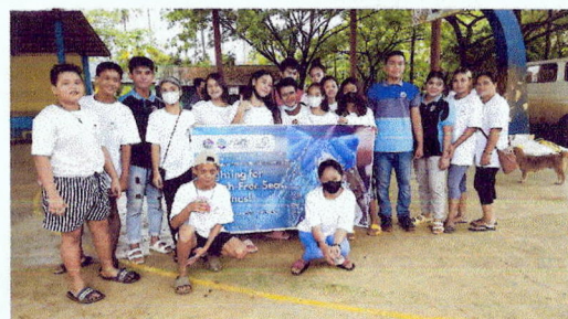
Coastal clean up at Sitio Marabahay, Bgy Rio Tuba, Bataraza, Palawan