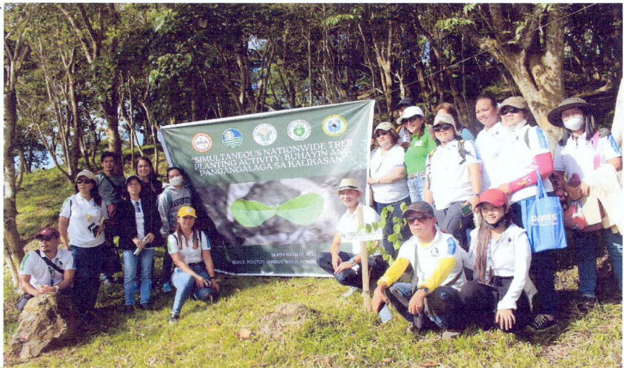
Group Picture together with DILG, DENR Personnel and Local Government of Boac Municipality