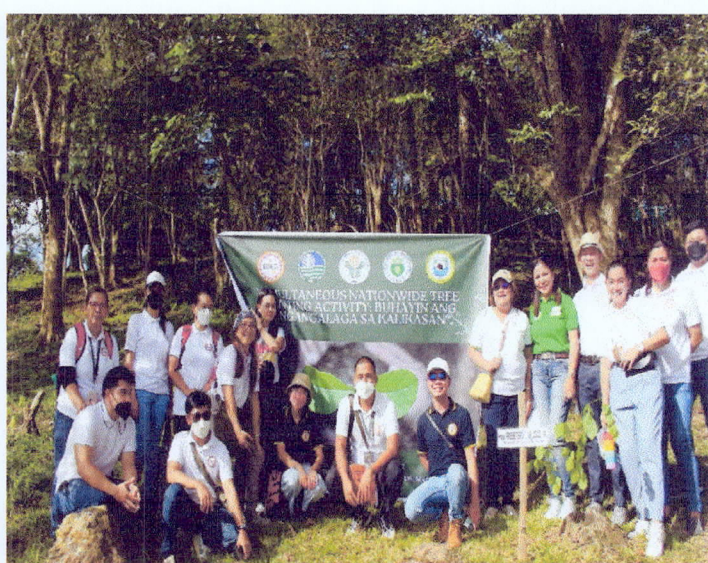
Group Picture together with DILG, DENR Personnel and Local Government of Boac Municipality