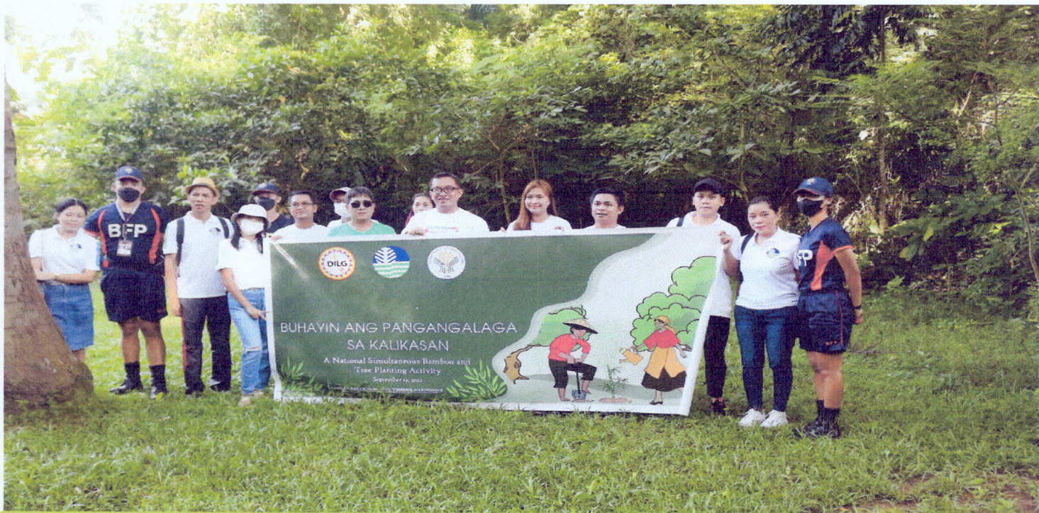
Group picture together with DENR Personnel, Bureau of Fire Protection (BFP) and Barangay Local Government (BLGU) of Poctoy