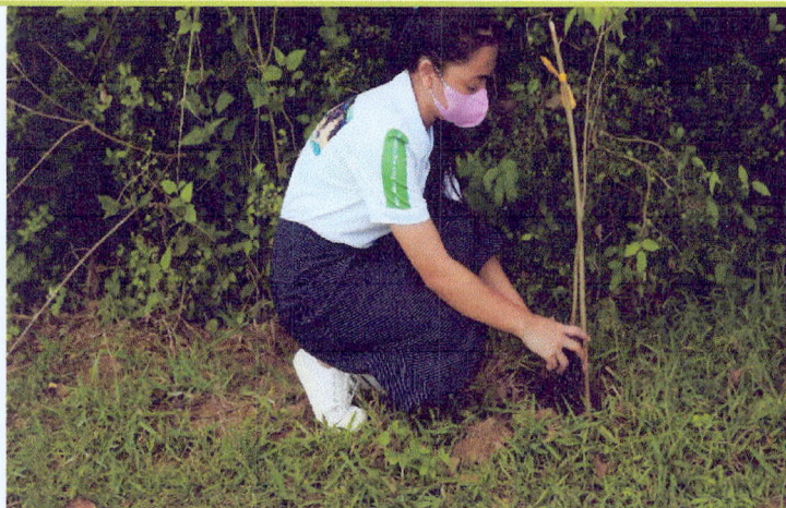
During tree planting activity at Brgy. Poctoy, Torrijos, Marinduque participated by DENR Personnel, Bureau of Fire Protection (BFP) and Barangay Local Government (BLGU) of Poctoy