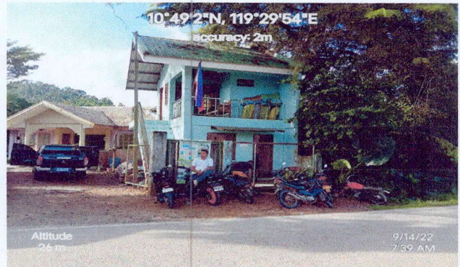
Information Office Bgy. Poblacion, Taytay, Palawan