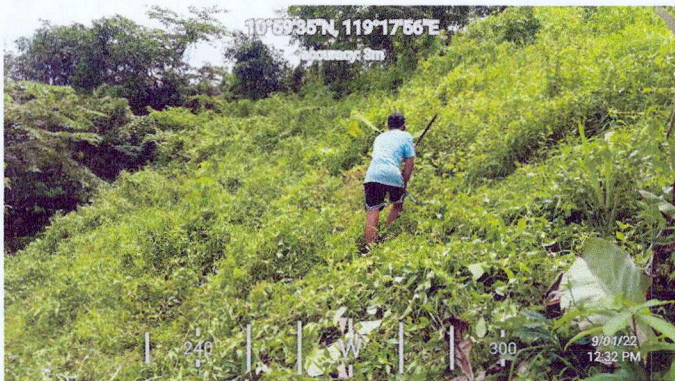
Usual clean-up of the Office and its surroundings at Park Ranger Station at Barangay Tumbod, Taytay, Palawan