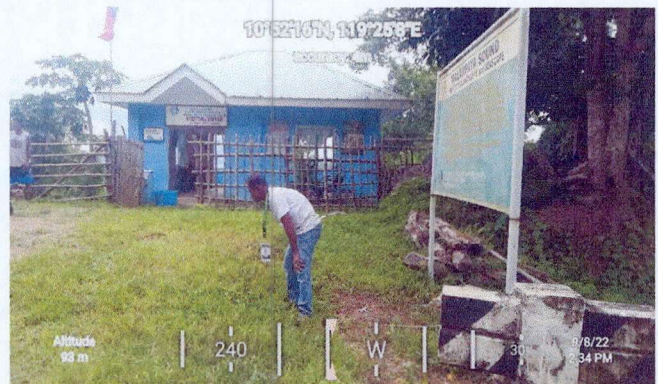
Usual clean-up of the Office and its surroundings at Visitor's Center, Barangay Pancol, Taytay, Palawan