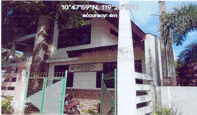
Usual clean-up of the Office and its surroundings at Protected Area Management Office- MSPLS