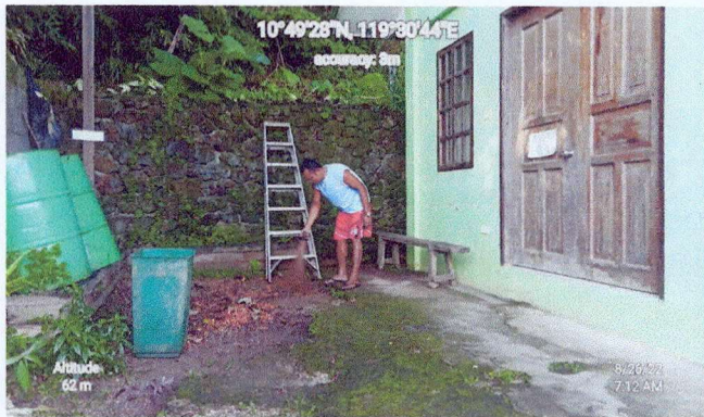
Usual clean-up of the Office and its surroundings at Conference Hall, Bgy. Poblacion, Taytay, Palawan