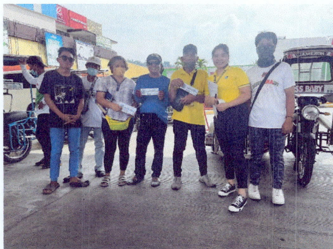
PHOTO DOCUMENTATION DURING THE DISTRIBUTION OF THE “NO TO PLASTIC” CAMPAIGN STICKERS AS IEC MATERIALS

Republic of the Philippines Department of Environment and Natural Resources MIMAROPA Region Provincial Environment and Natural Resources Office