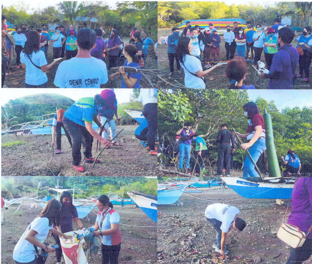
Mangrove tree planting cum coastal clean-up at So. Balisungan, Barangay Tagumpay, Coron, Palawan. This event also attended by selected employees of Local Government Unit of Calocan.

units in Palawan, people's organizations, government agencies, teachers, barangay health workers, and the youth attended the consultation.