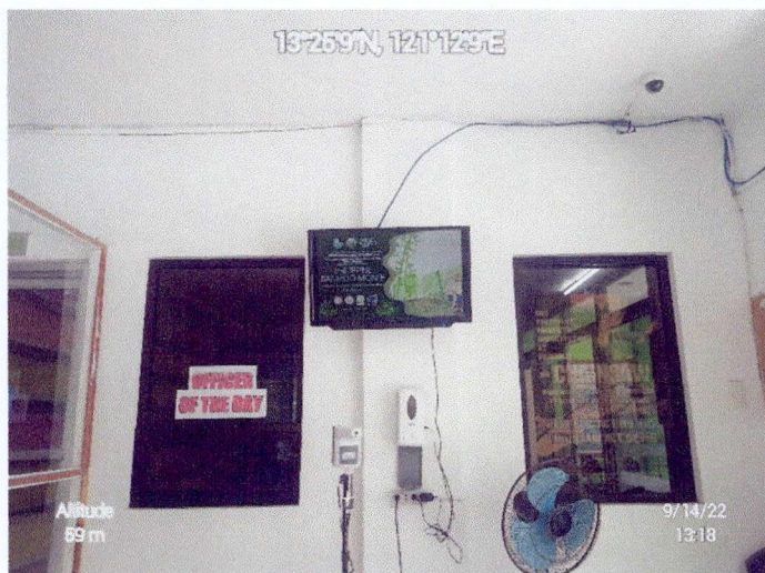
Philippine Bamboo Month Celebration